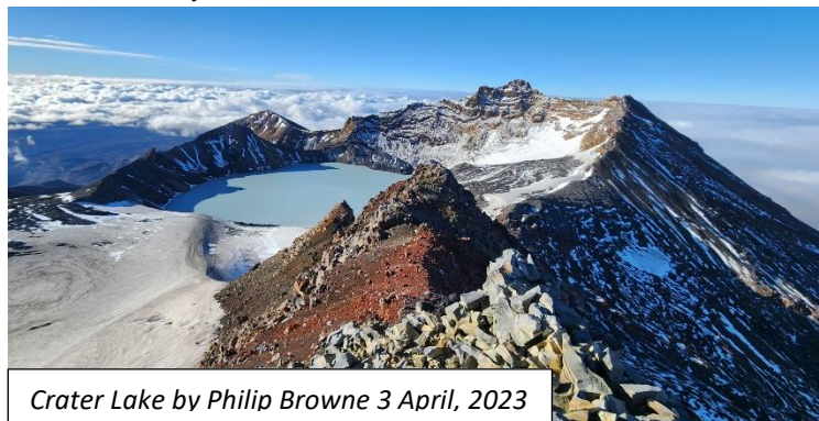
Crater Lake by Philip Browne 3 April, 2023