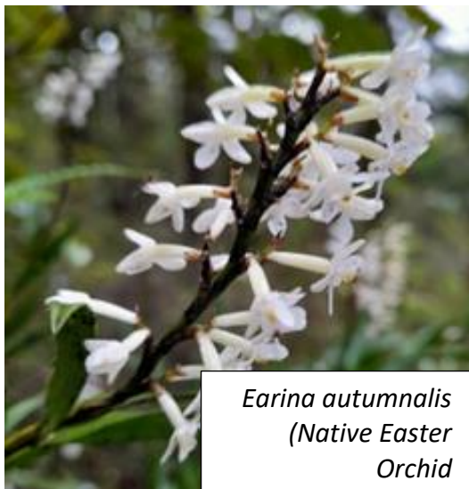
Earina autumnalis (Native Easter Orchid)