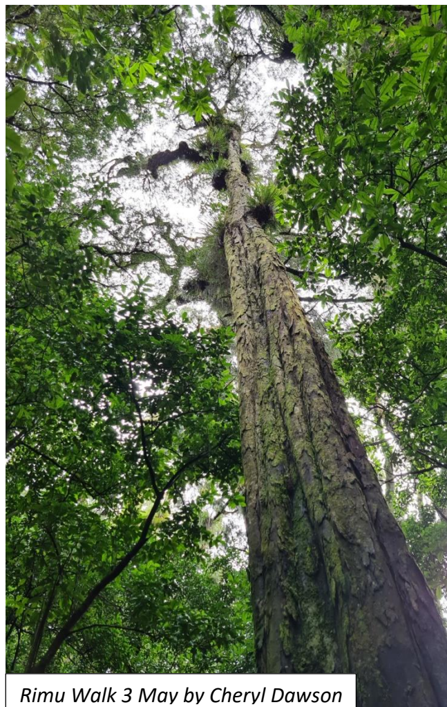
Rimu Walk 3 May