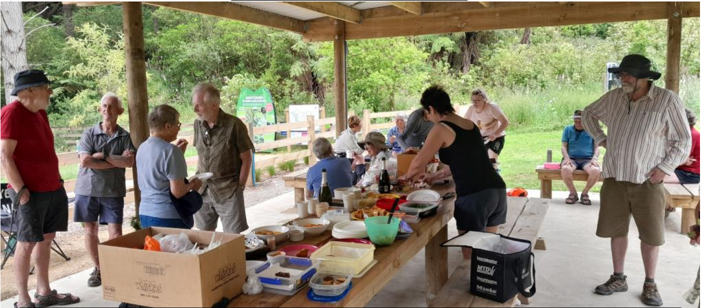
Wednesday 14 December, Kahuterawa Road end. A sunny morning: 20 trampers walked along the Sledge track while 5 chose the Back Track. Another 9 joined us for lunch.