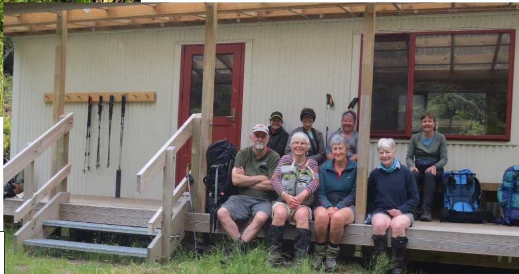
Iron Gate Hut 6-7 Dec, 2022