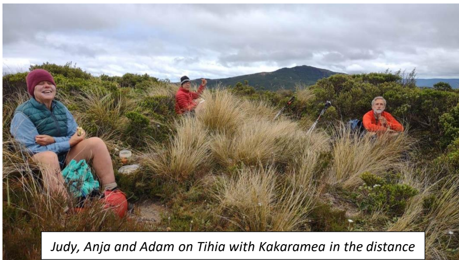
Judy, Anja and Adam on Tihia with Kakaramea in the distance

This peak is on the northern side of highway 47 not far before Turangi. The track starts just north of Papanetu Stream where there is room to park the car off the road. The track starts as a logging road and, where it branches, we took the left fork which had obviously suffered a lot of foot traffic and had triangular track markers for the stoat traps. Higher up we had to make do with flagging tape markers, which were very useful up in the scrub belt which is about the last 100 m of the 500 m climb (2 hr). The lower section is in good quality forest, but eventually transitions through to the scrub which crowds the track. Long sleeves, and maybe long-johns, would reduce the scratch count.