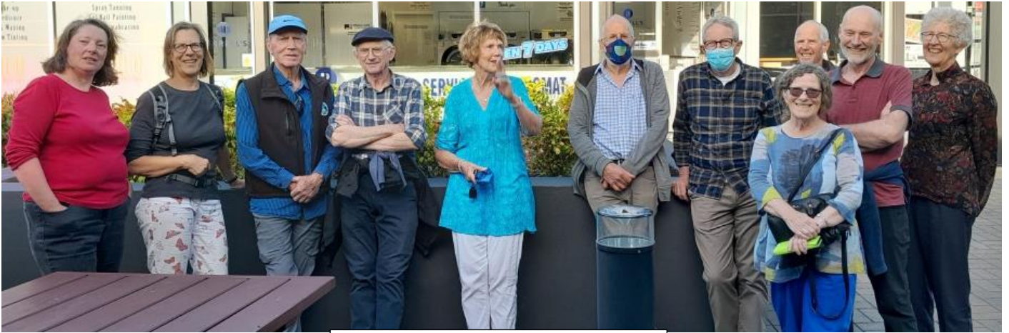
Tuesday 6 December, Summerhill