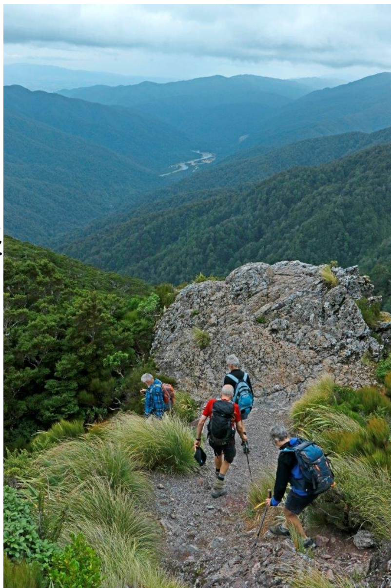
Powell Hut trip 3 Feb, 2022