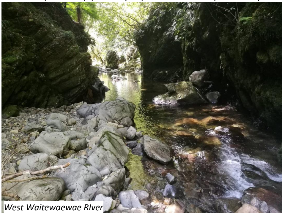
West Waitewaewae River

pool I found that I could easily gain the terraces on the true left, which provided excellent and fast travel down this section of river, avoiding any swimming along the way. I regained the river and was soon at the Waitewaewae-Otaki Forks. Travelling up the Waitewaewae River I managed to keep dry from the hips up. A hind with a fawn, and then a stag, two hinds and fawn, were seen at close quarters as I headed upstream.