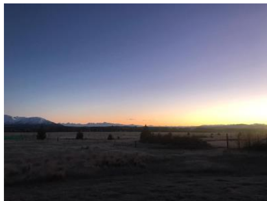
Near Twizel (above). Tracks on Ohau (below) More at club night on 3 Sept