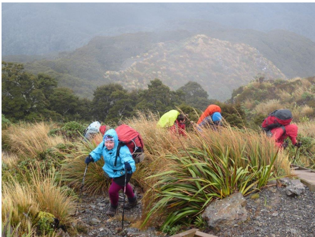
Approaching Powell Hut