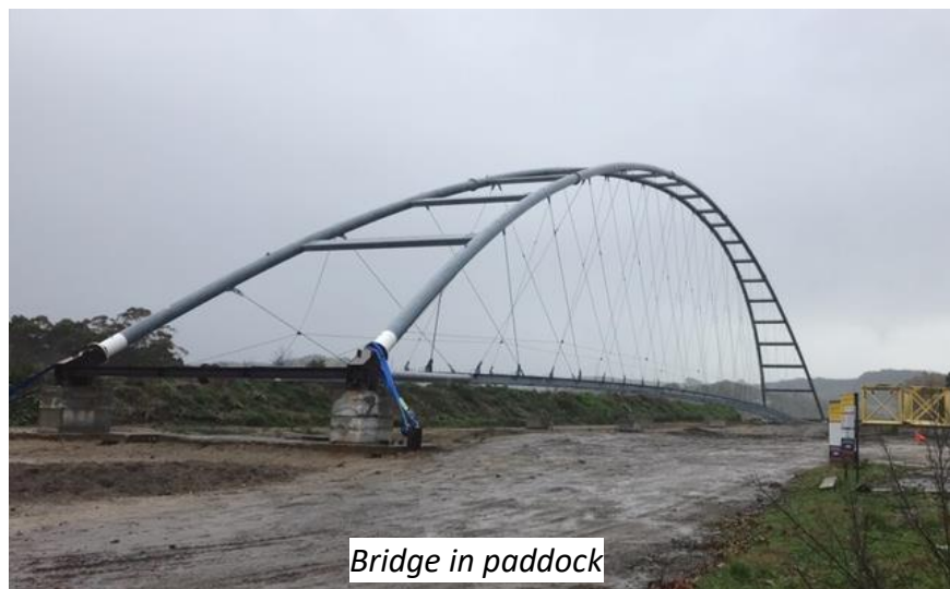
Bridge in paddock

The hardy (!) trampers then had to leave the warmth and comfort of the homestead and go back out into the cold to finish the rest of the tracks mainly the wetland area where a lot of Kereru were seen in the tree lucerne. Some HiHi also seen at their feeding stations.