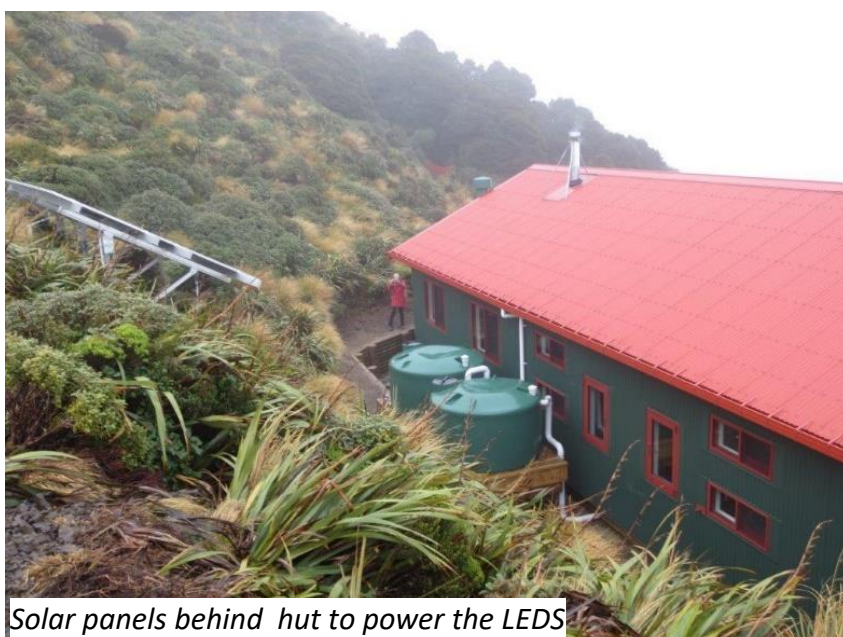
Solar panels behind hut to power the LEDS

getting changed into dry warm clothes we all headed for a hot drink at Mt Bruce, except for Ben who was going back to Wellington.