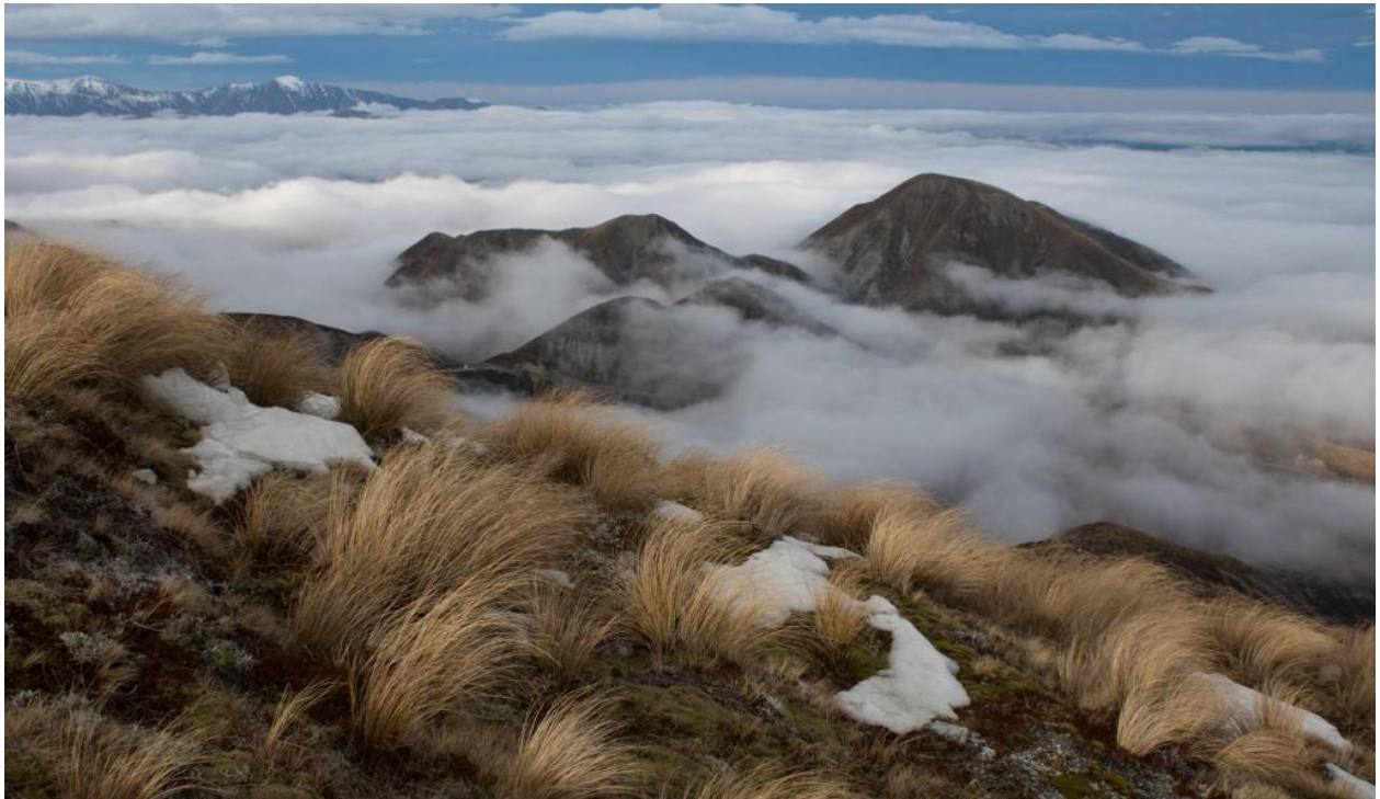
View of the tops from the Dobson Ski-field road, South Island