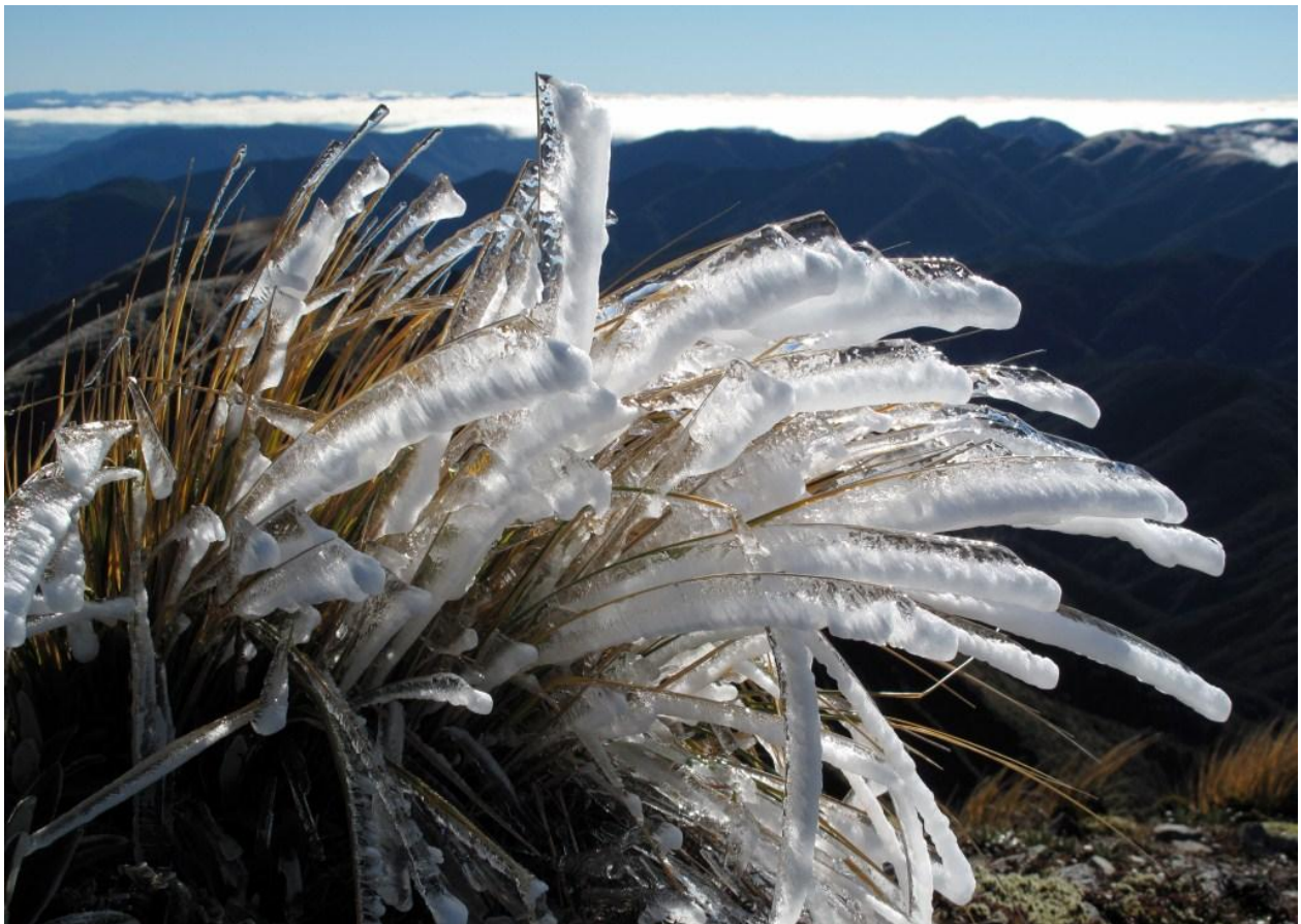
Near Te Atuaoparapara, Ruahines (Queen's Birthday weekend)