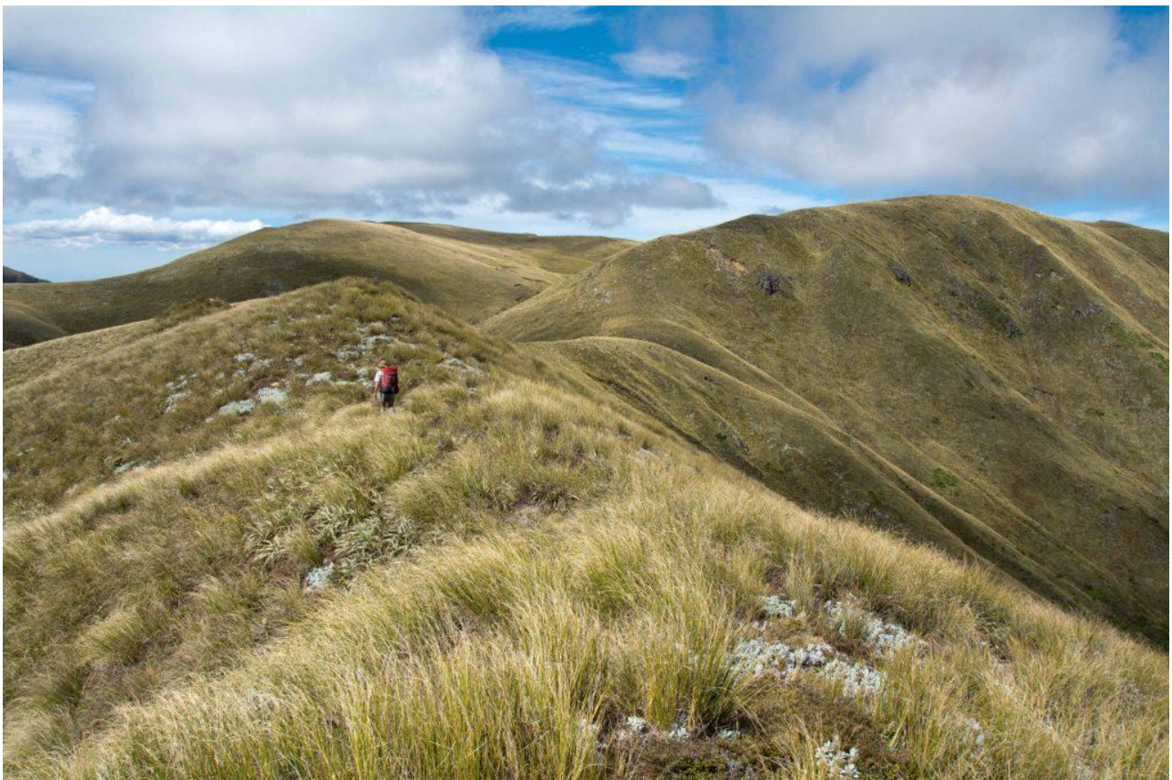
Brian heading up onto the Hikurangi Range, Ruahines