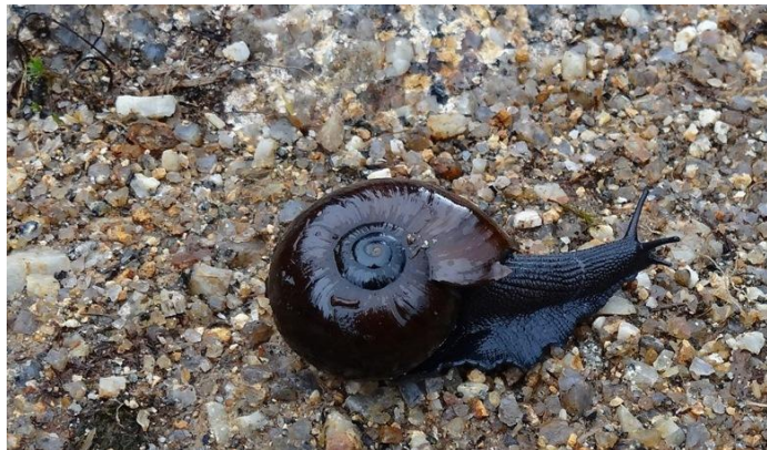
Sauté in garlic butter

Weekday trips generally range between Easy and Medium/ Fit. Call the leader for details on the destination and trip grade.