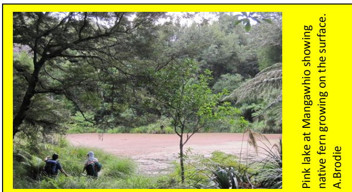
Pink lake at Mangawhio showing native fern growing on the surface. A. Brodie