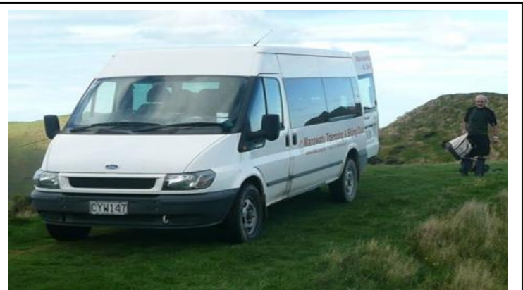
Thur trampers carpark for access to Hinerua.

Mount Bruce - Just downstream of the old bridge our group of 21 easily waded the chilly stream to follow the new track up to join Braddicks track. Although we did not find a route to the larger area of open grassland top remembered by some, we nevertheless found good views & enjoyable tramping. Marion Beadle , Wed. Group.