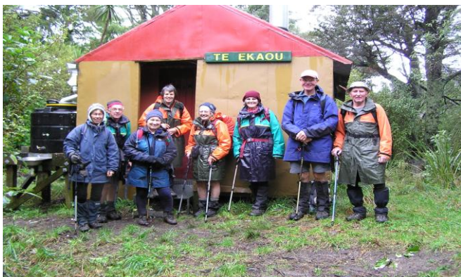
Thursday Crew on 28 April

Weekday trips generally range between Easy & Medium/Fit, so call the leader for details on these to plan a suitable daytrip to suit your preferences.