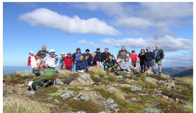
Lunch spot for Thu trampers on Hinerua Ridge, 12 May