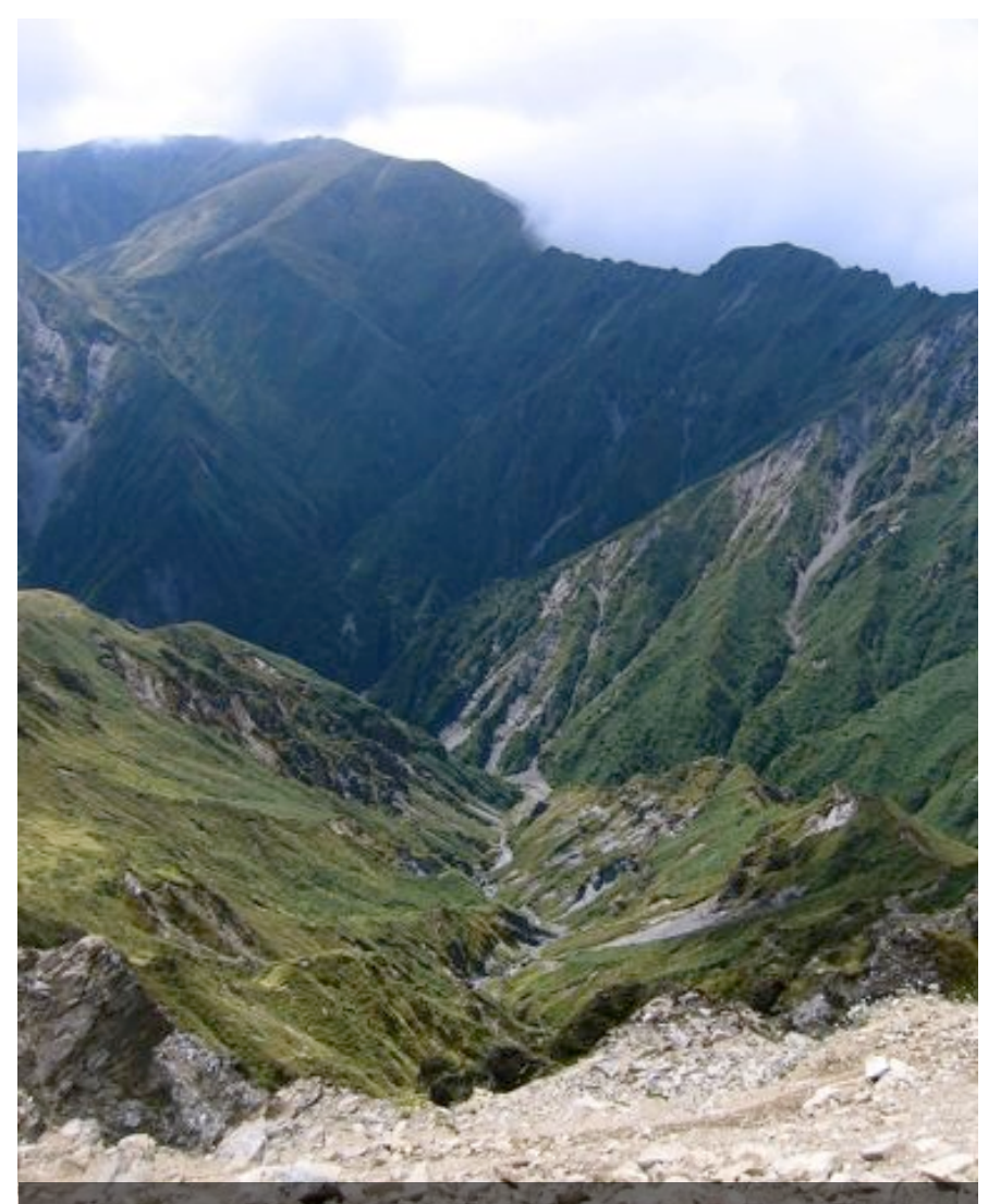
Sawtooth Ridge and Pourangaki River headwaters from Te Hekenga.

Next morning we headed up to Waiotupurutia Saddle (2hr) and attracted the notice of a couple of Sika, which whistled at us. Instead of taking the track down into North Arm, we continued climbing up to Maungaorangi, on which there is another geo-cache hidden under the cairn. Maungaorangi peak is an open-topped alpine meadow with ankle high vegetation. The