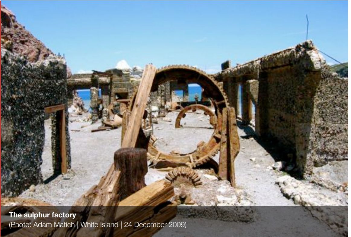
The sulphur factory

(Photo: Adam Matich | White Island | 24 December 2009)