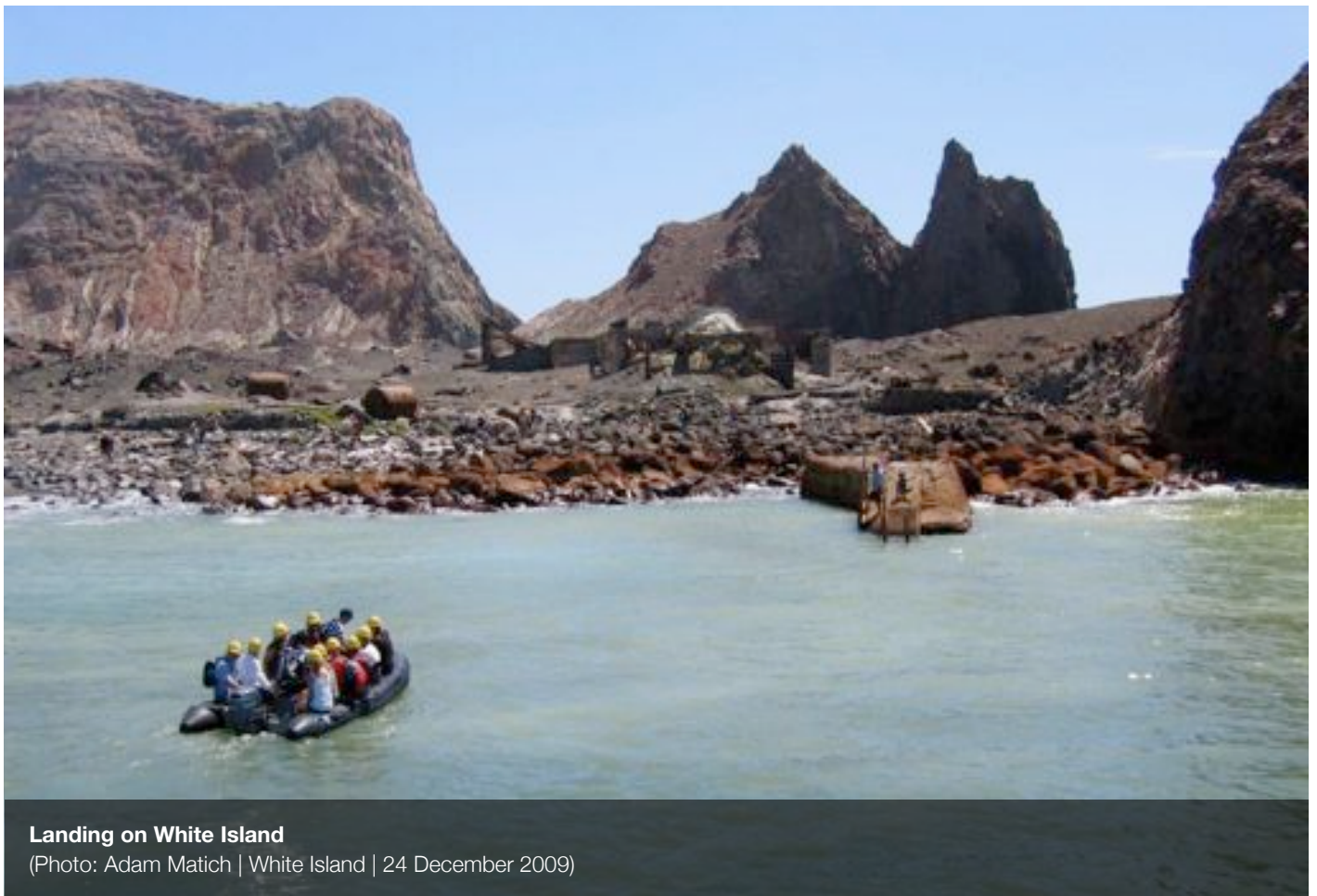
Landing on White Island

(Photo: Adam Matich | White Island | 24 December 2009)