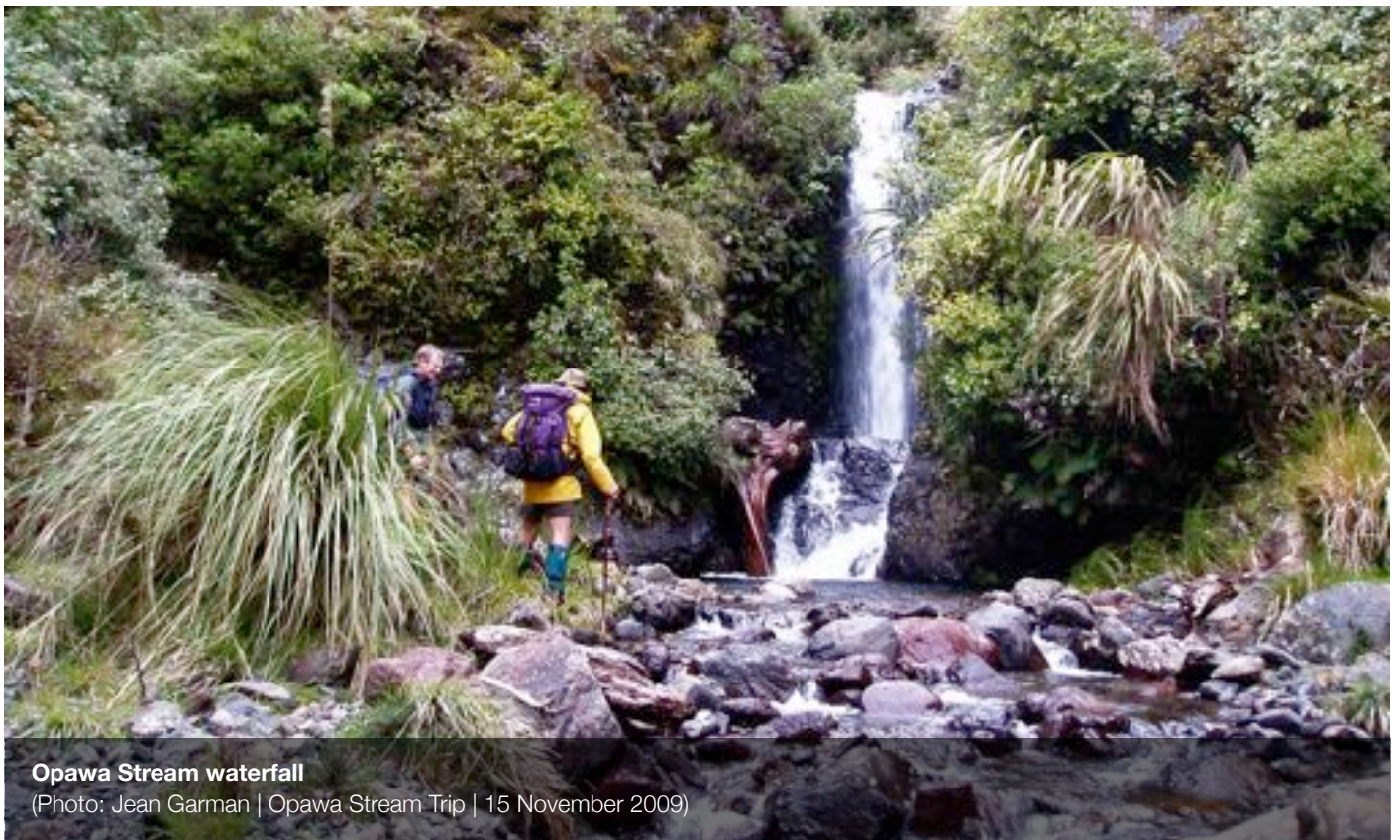
Opawa Stream waterfall

(Photo: Jean Garman | Opawa Stream Trip | 15 November 2009)