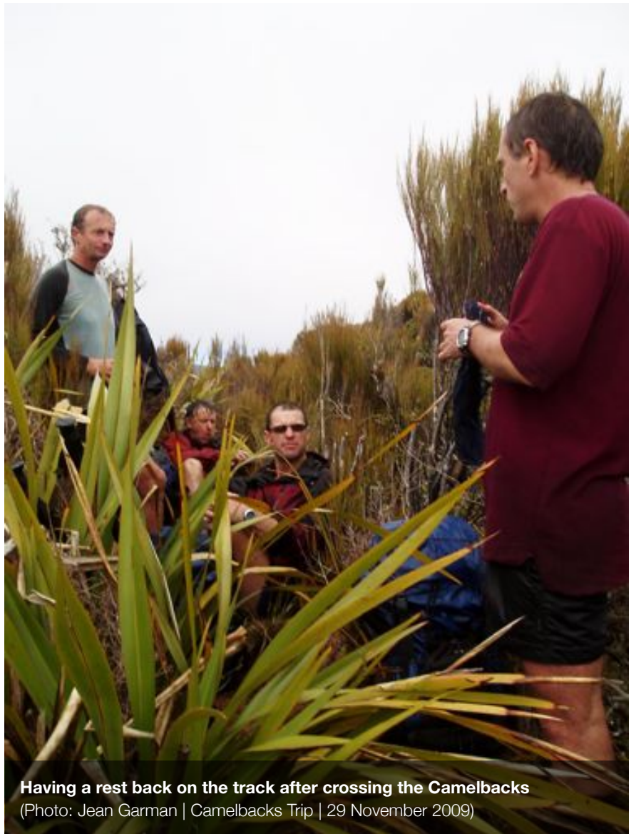
Having a rest back on the track after crossing the Camelbacks (Camelbacks Trip | 29 November 2009)

After the steepish start of the Colenso track we enjoyed the easy pace through the lovely Beech forest and flowering Olearia slightly marred by having to scramble over or around several large trees fallen on the track in different places. Although work had been done on the track obviously there is a lot more to do there. Out of the forest and into the open climb up to the tarn we had some lovely views and found a nice spot above the tarn for lunch. We watched some of the group make their way up the track to the trig with the cloud coming down making them invisible and then the cloud lifted so we could see them standing at the trig. With the sound of thunder in the distance we decided to leave the