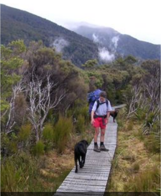
On the Pig Flat boardwalk, Kathy talks to Po with Oscar behind and Powell Hut visible on the ridge. (Totara Flats Trip | 23 November 2008).

We, Nicola, Saman, Chris and I, set out from PN at 8:00 with the weather report promising occasional showers, but a warm day. The showers were over by the time we reached the Kiriwhakapapa road end. With the promise of the day we left the umbrellas behind and set off through the grove of manificent Sequoias at 9:30. Across the stream and then up, a gentle enough climb for the first part, but the steep slog to the top of the spur soon killed the gossip. Not having been there for maybe 20 y I was