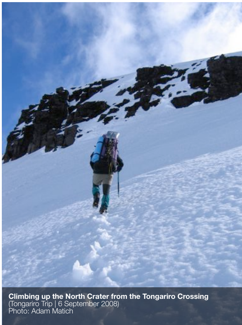
Climbing up the North Crater from the Tongariro Crossing (Tongariro Trip | 6 September 2008)

tents for breakfast before heading off to the summit of Tongariro to meet up with team Ngauruhoe once more. We beat them there so were heading down the ridge before we bumped into them. Brian headed straight off to the hut while Adam and I took a slightly longer deviation stopping to observe the few minutes worth of skiing action on the slopes above us. We played lizard