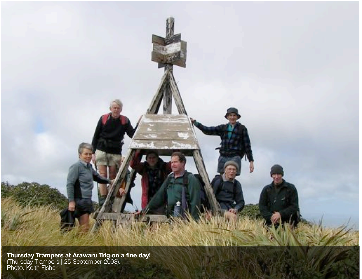
Thursday Trampers at Arawaru Trig on a fine day! (Thursday Trampers | 25 September 2008).