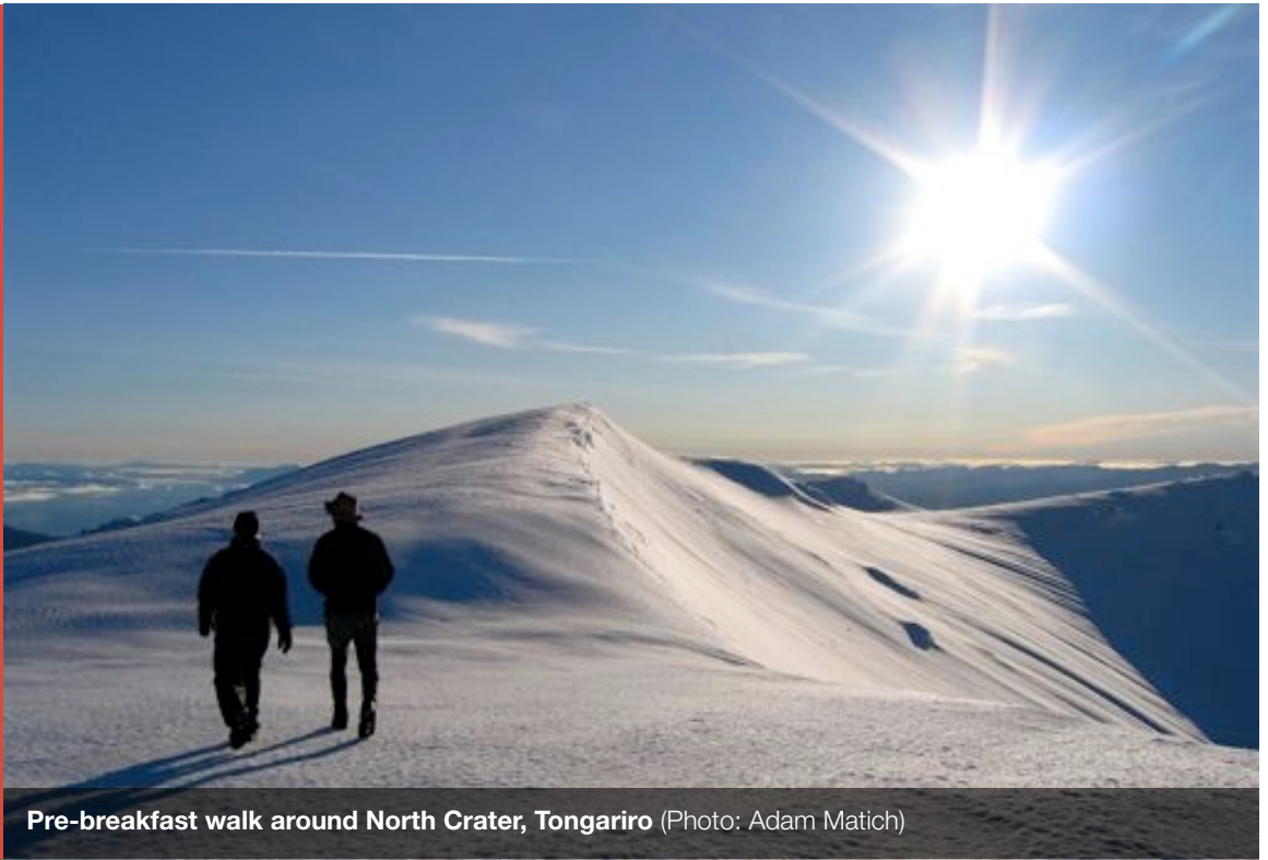
Pre-breakfast walk around North Crater, Tongariro