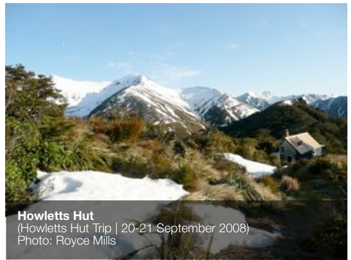
Howletts Hut (Howletts Hut Trip | 20-21 September 2008)

Next morning a cool breeze (there is no other sort when there is snow on the ground) was blowing as we headed down to Daphne Hut for morning tea before following the Tukituki River North Branch to where the track back to Kashmir Road starts. The water was ice cold and deep enough to keep ones feet wet so it was good to leave the river after half an hour and climb up and over the ridge and out to the road. A short road walk by one of the group to get the car and then to the ice-cream shop in Dannevirke and home again, we were Royce Mills, Mark Learmonth and Tony Evans.