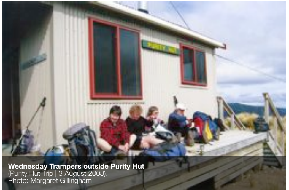
Wednesday Trampers outside Purity Hut (Purity Hut Trip | 3 August 2008).

The walk back to the hut in the afternoon sun was very pleasant with everybody feeling like they had expended some energy. It may seem a little strange to spend the whole day for only one ski run, but what a run. Everyone was buzzing over dinner and wine. Sunday saw the team saddle up for an attempt at Tongariro. We climbed up the ridge behind the hut that leads past soda springs and up onto Tongariro itself. Once we reached the snow, crampons and skins were the order of the day. It was a really climb with a cool breeze to stop us getting overheated. We met the three