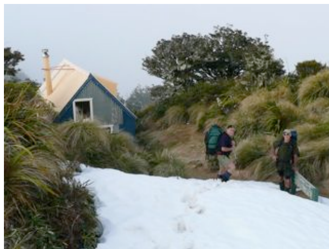
Tony Evans and Mark Learmonth at Howletts Hut (Howletts Hut Trip | 20-21 September 2008)

Track conditions were surprising - Kelly Knight track appeared not maintained after the junction with Wooden Peg track, rather rough and narrow, although the new detour over the slip was appreciated. By contrast the track up to the tops was wide and easy, much slashing of leatherwoods and toe toe having been done, and new blue-topped waratahs signing the track.