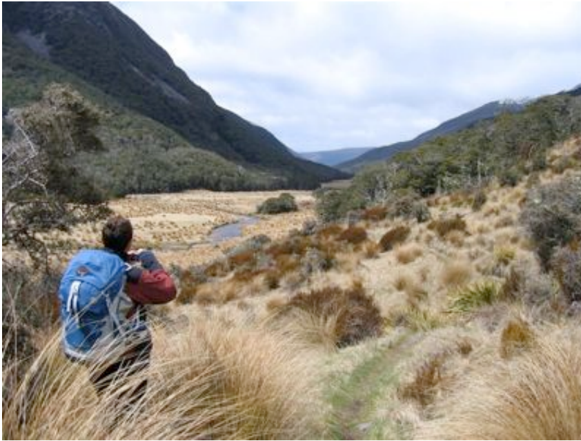
Left: Lower part of the Cobb Valley (Cobb Valley Trip | 21 Oct 2007)