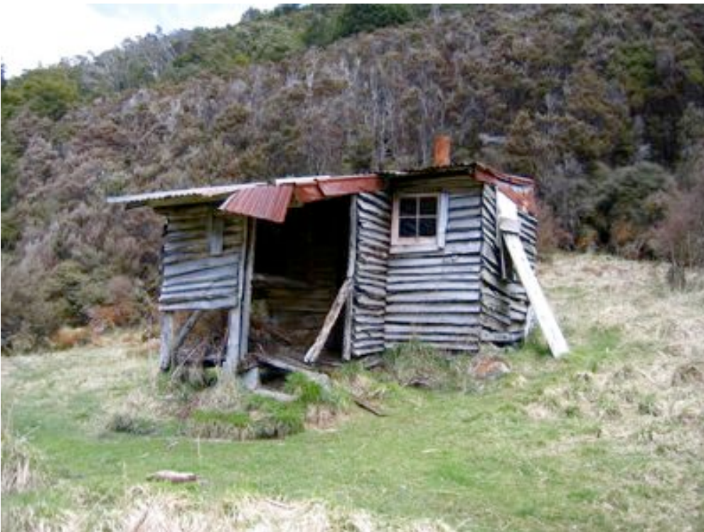
Left: Chaffey Hut (Cobb Valley Trip | 20-22 Oct 07)

As the weather was holding, we did a 40 minute round trip that afternoon to Myttons Hut, which is a tidy 4-berth affair with a good view down the reservoir towards the dam wall. The weather was nasty overnight again, but it started to clear up around mid-morning on day three. We drove down and across the dam wall to have a look at the car park at the Sylvester Hut (formerly Bushline Hut) road end. Sylvester Hut is in a lake-infested region on the open tops and looks to be a really good place to go in nice weather. On our way back up out of the Cobb Valley we stopped at the lookout to view the reservoir, and view across to Sylvester Hut which is just visible up on the bushline. The Cobb Dam Road then dropped us back down into the Takaka River and we picked up the 4WD track that sidles up the river to the asbestos mines (1 hour).