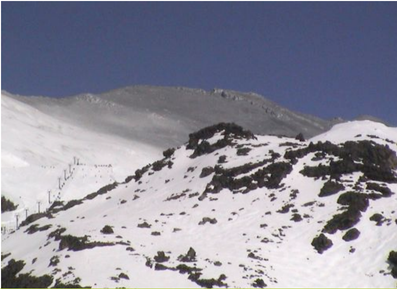
Above: Whakapapa Skifield, four days after Ruapehu 'burped'

the Waikamaka River and downstream to the Hut. Then we eat our lunch and come home again.