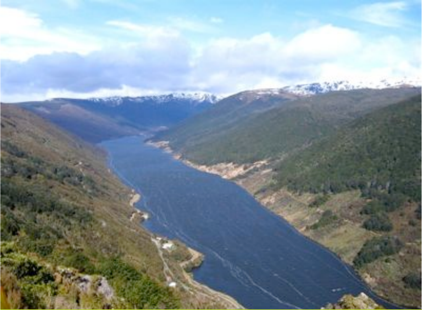
Above: The Cobb Reservoir from the lookout (Cobb Valley Trip | 20-22 Oct 07)

We soon found that we were overdressed, as now we were out of the Cobb Valley, the weather had miraculously improved. Holding our collective breathes while passing through the mine workings proved impossible, so we trusted to luck and took the 40 minute climb up to the historic Asbestos Cottage. This quaint 4-berth cottage is on a steepish hillside in a small clearing on a track that leads down into the Mt Arthur track system. Once back out again we headed back to Nelson to pick up our 6:30 p.m. flight back to Wellington to subsequently get back the Palmerston North well in the dark.