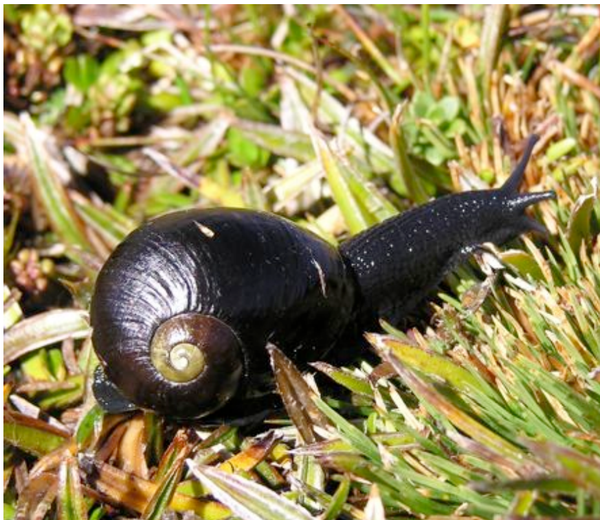
Left: Powelliphanta Winner of the Natural History category of the club photo comp.

We also extend an invitation for all friends of Forest & Bird to enjoy our celebration events, details of which will be announced shortly at www.forestandbird.org.nz