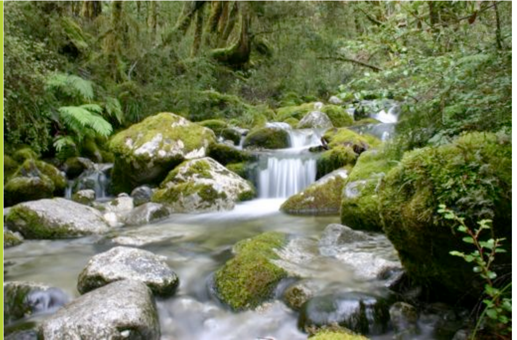
Right: Milford Track Stream Third place getter in the scenic category of the club photo competition