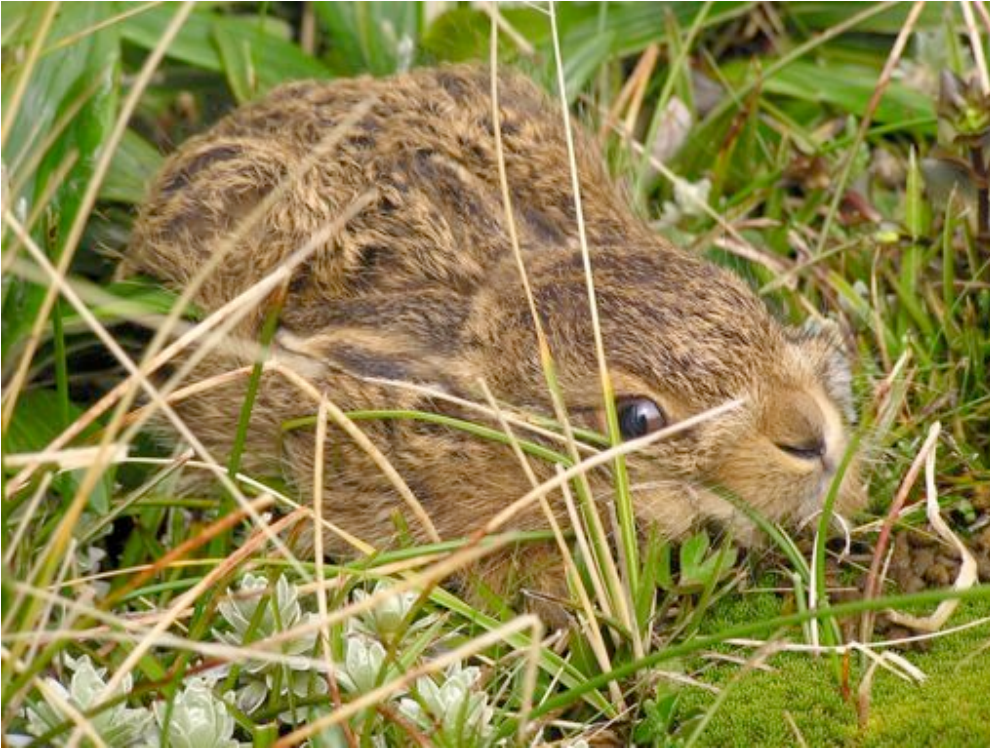
Left: Baby Hare near Arete Third place getter in the Natural History category of the club photo competition

an old track system that veers left off the main track to peak 713, from where we dropped into a little saddle to the SE and continued on the old, sometimes marked, route to eventually reach the open on peak 858. The last 200 m up onto 858 was kindly cut, by someone else, through scrub and leatherwood. In a couple of spots a little attention to navigation was needed as the route wanders around like a drunken teenager. We had good views on top, but it was a bit windy, so we headed NE to 835, an important turning point. In a previous attempt at this trip we had sailed through this point and ended up bush-bashing our way down into Rawnsley Stream.