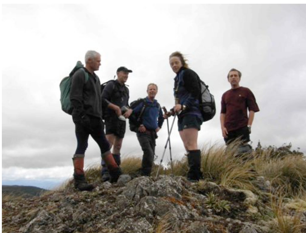
Left: High point of the loop (Putara Road end Trip | 16 September 2007)

Four hundred metres down stream (some got wet feet) we hit a confluence, then headed 20 m up the next stream to another confluence, and 20 m up the left fork to find the bottom of the Bottles Track (some looking was required). 30 minutes travel up the Bottles Track saw us on the Herepai Track. The Bottles Track is a little vague in places, so we put Jenny out in front to lead and exercise us. 2½ km down the track towards Roaring Stag Lodge was our next off track section, 3 hrs from the road end. This is