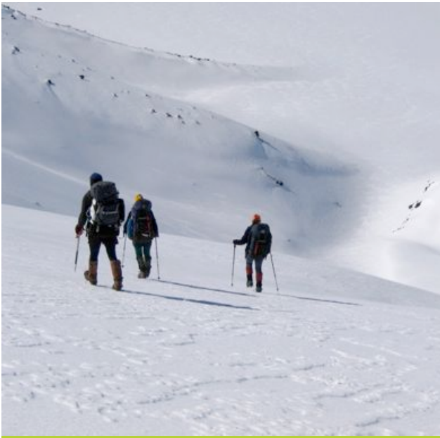
Above: Walking down to Centre Crater

(Oturere Hut Trip | 25-26 August 2007)