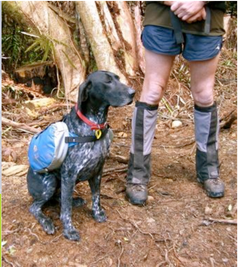
Right: Waiting at Totara Flats

(Oturere Hut Trip | 25-26 August 2007)