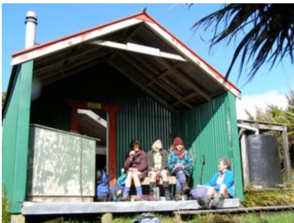
Left: Herepai Hut (Herepai Hut Trip | 30 Aug 2007)