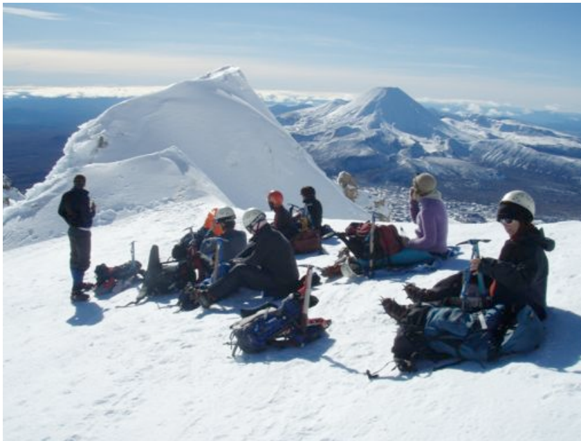
Left: Luncheon, Mount Ruapehu Second place getter in the alpine category of the club photo competi- tion