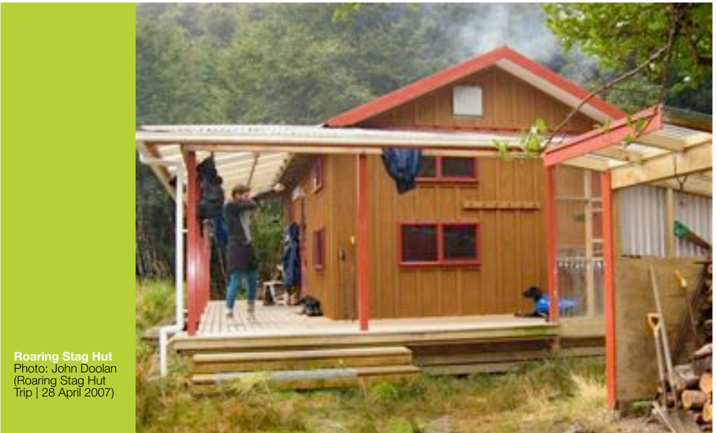
Roaring Stag Hut (Roaring Stag Hut Trip | 28 April 2007)