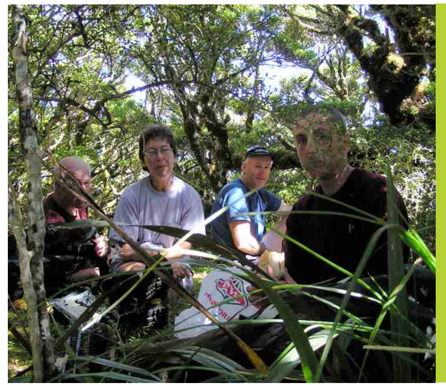
Te Mara Lunch Mikimiki Saddle-Te Mara Loop 11 March 2007