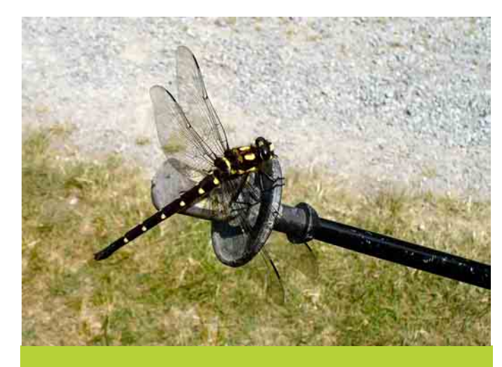
Dragonfly resting on a walking pole Powell Hut Trip | 21 January 2007

Took them about three hours to get to the hut for lunch.