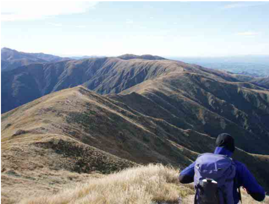
View across the ranges from Tunupo to Longview Hut