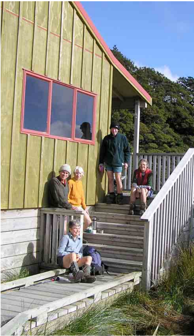
Left: Thursday Trampers outside Waiopahu Hut (Thursday Day Trip | 18 May 2006)