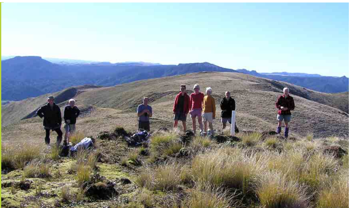
Thursday Trampers on the Mokai Patea Range

This did not go on account of the leader being involved in a stretcher carry on Saturday night/Sunday morning.