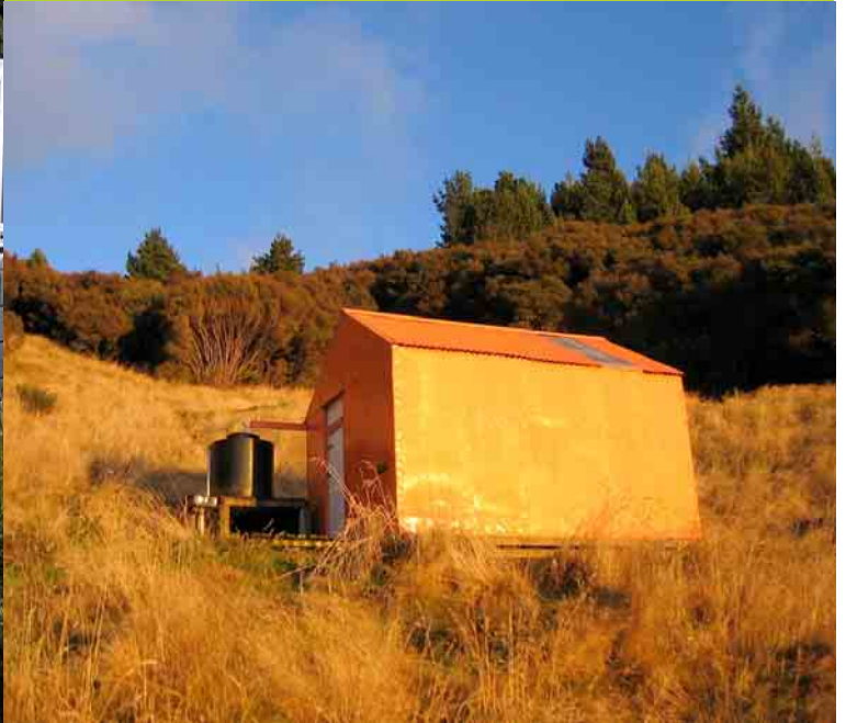
Below: Poutaki Hut (Poutaki Hut Trip | 28 May 2006)