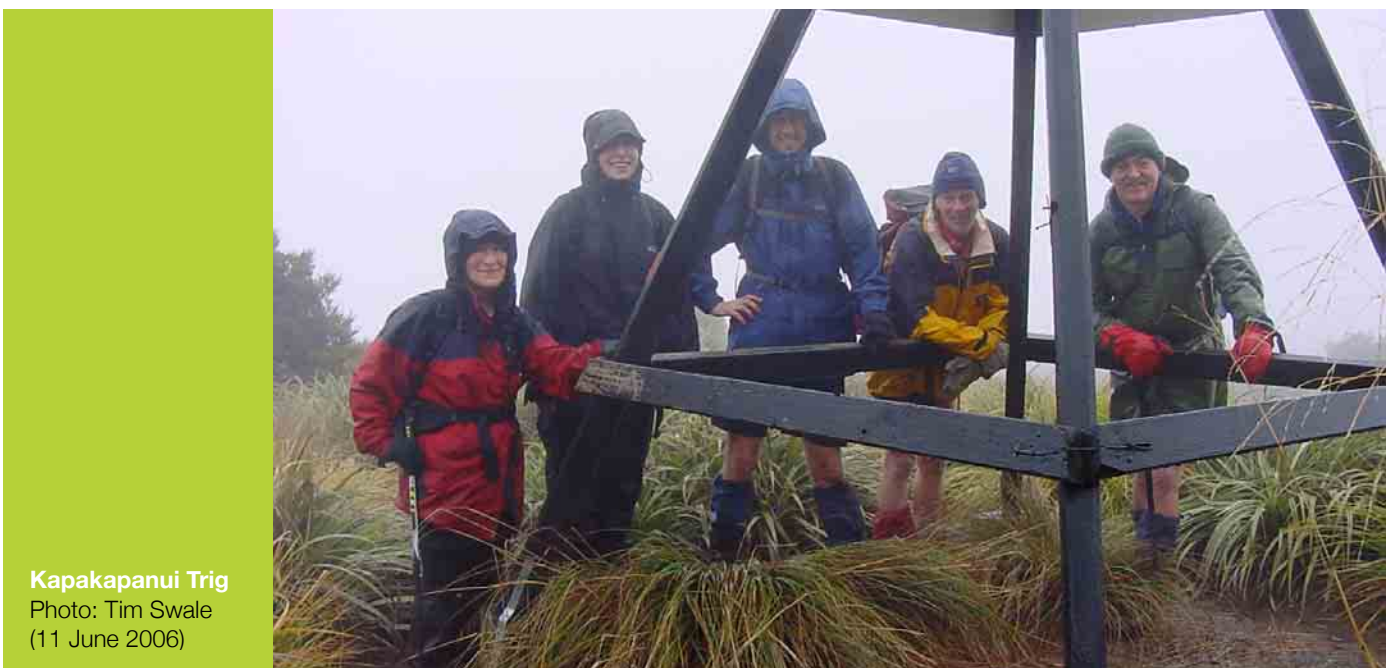
Kapakapanui Trig Photo: Tim Swale (11 June 2006)

This trip went according to plan apart from the weather. It was a bit slower than usual owing mainly to the muddy conditions. As it was a little bit windy on top we didn't linger, apart from a couple of photos but pressed on to have lunch at the hut. We got little rain. There were a couple of changes to the track: it seems that the branch track down to the Ngatiawa Camp has been closed (I didn't see the old sign) and the last part of the return track down from Ngatiawa trig has been redone and zigzags down more to the south where it drops into the tributary of the Ngatiawa River, close to the memorial cairn. This was noted in the last issue of Beechleaves. Thus it avoids the private land where they are trying to regenerate the forest.