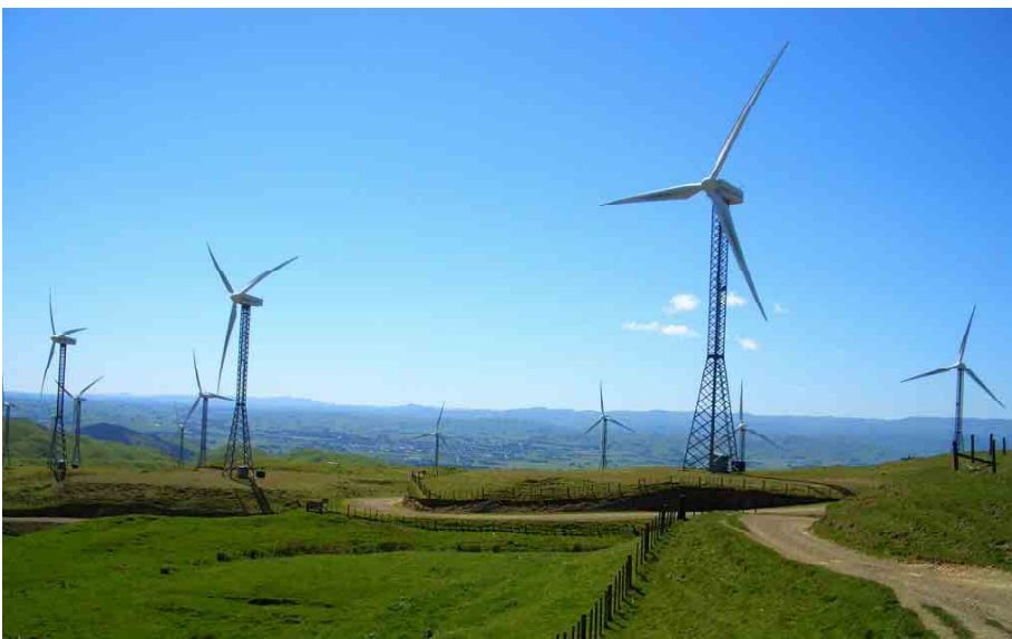
Above: Tararua windfarm windmills along North Range Road. (North Range Road Trip | 27/10/2005 | Photo: Christine Allardice).

This trip will start from the Mangatepopo Road end. The intention is to climb Ngauruhoe and quite possibly Tongariro as well. This all depends upon the weather, the phase of the moon, and how people (meaning me) feel on the day. Under ideal conditions we might climb Ngauruhoe on Saturday and camp in the South Crater to return to the Road End via Tongariro on Sunday. If conditions are a little less ideal we