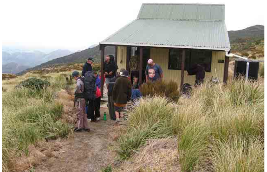
Above: Everyone gathered outside Longview Hut. (Longview Hut Trip | 30/10/2005).

From Kashmir Road end the track climbs up to Longview Hut, with frequent stops to admire the view we arrived at the hut for a coffee break in the company of a scout group from Ashhurst who had spent the night there. Some of our group stayed at the hut while three of us followed the ridge south to Rocky Knob (1226 m) to admire the view, from there you can look south over the Makeretu Stream catchment and see the ridge the Apiti track follows and to the southeast Toka and Tunupo Back to the hut to regroup and another coffee, then we headed north with views of Daphne Range and beyond, the snowcapped peaks of Te Hekenga and the Sawtooth Range disappearing up into the high cloud, a great stroll with views all around, not too hot or too cold and no wind at all. Along the ridge until we met the track into Daphne Hut