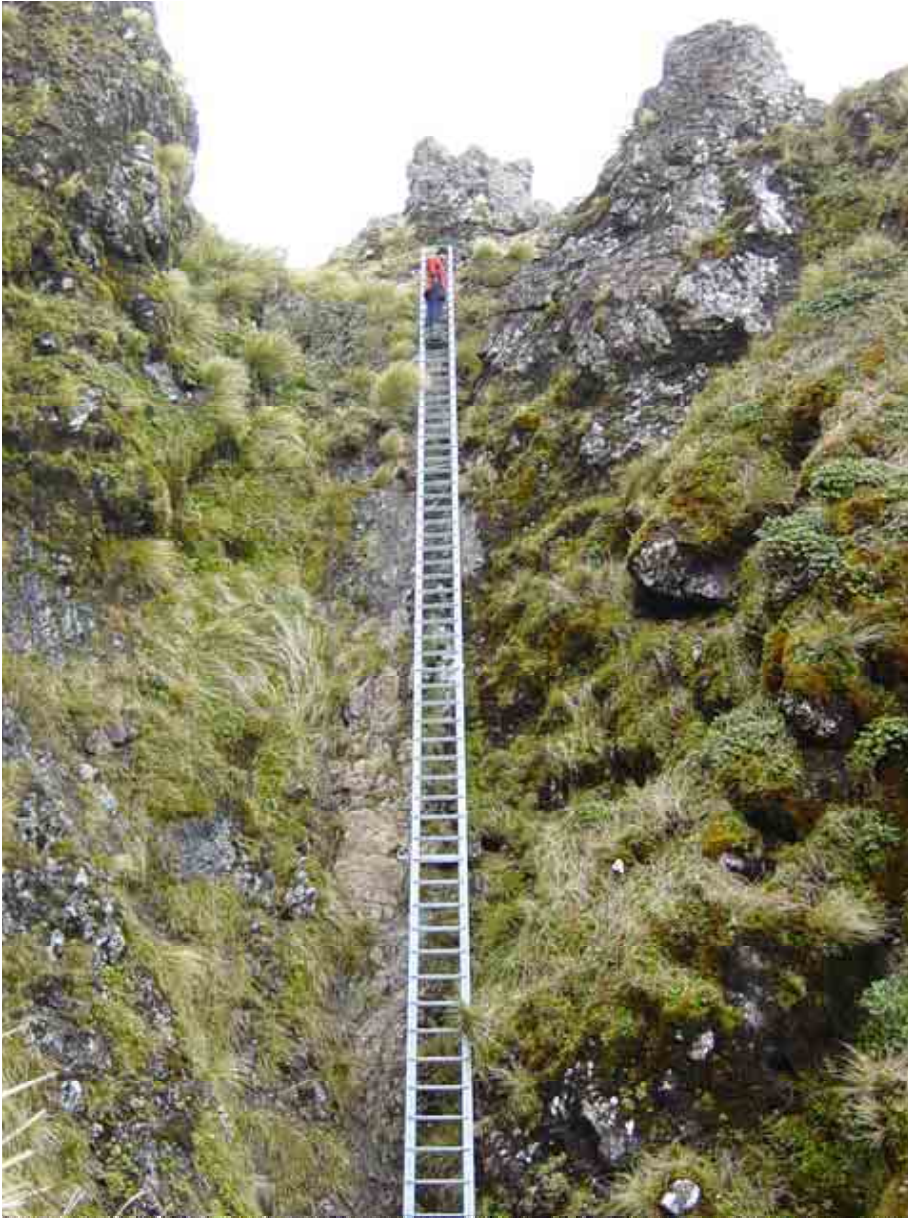
Above: Garry Grayson on the step ladder on the Tararua Peaks. (A wander in the Tararuas Trip | 21-24/10/2005).

of the 'PN team xtreme' who had been there a few weekends ago. We were not impressed. We dealt to the downed tree and cleared away a few saplings. Everything worthy of firewood was taken up to the hut and the rest was gloriously consumed with a bonfire.