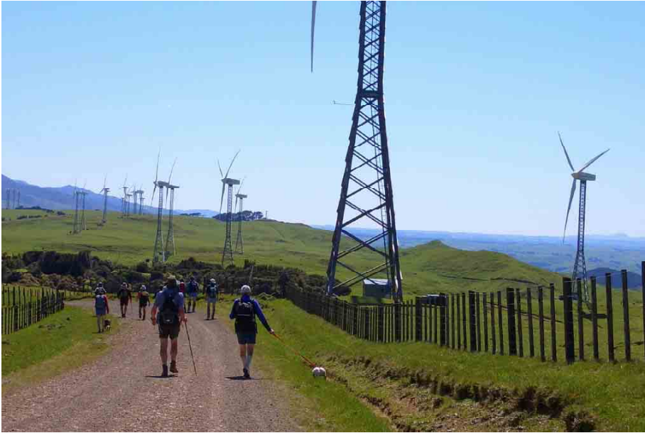
Above: Wandering among the windmills. (North Range Road Trip | 27/10/2005).