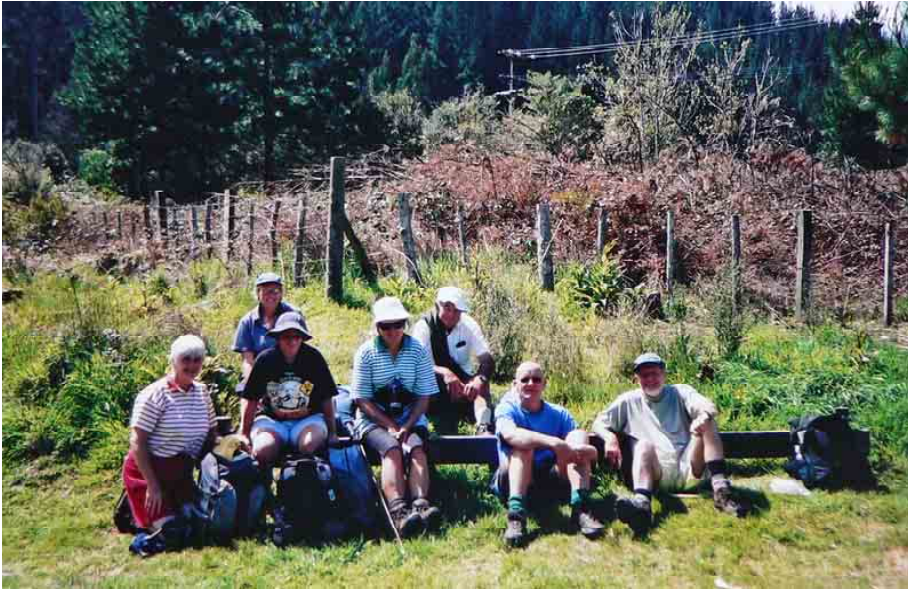
Above: One good reason to tramp on a weekday, it always seems to be sunny. (Mangaone Walkway Trip | 26/10/2005 |).

may lazily go into Mangatepopo Hut for Saturday night and then climb Ngauruhoe on Sunday.