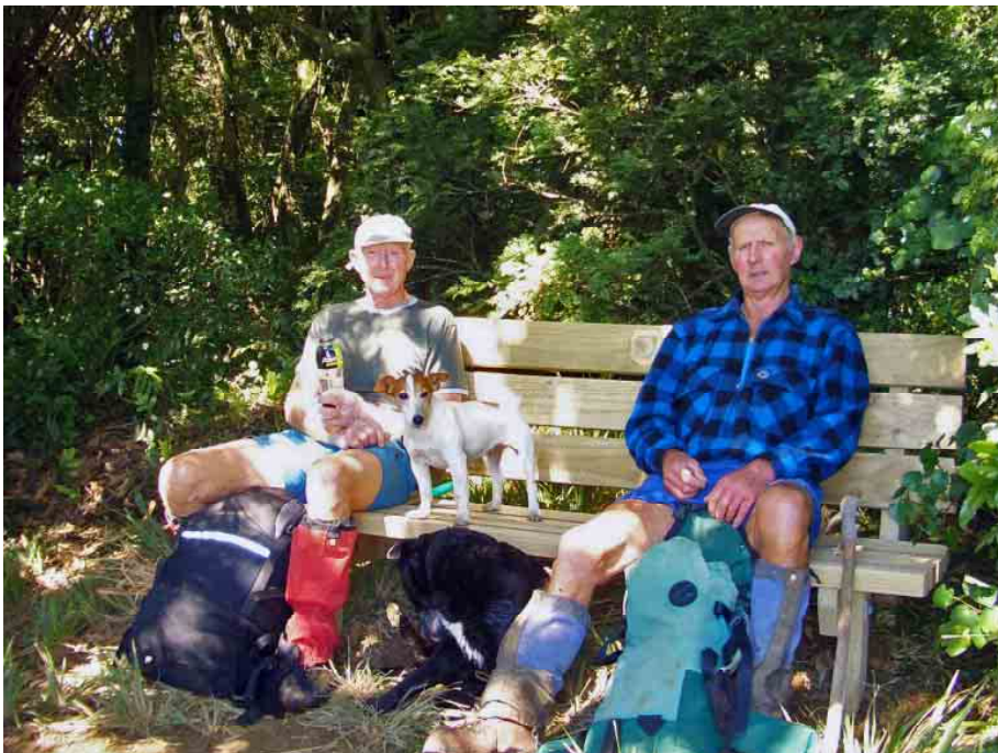
Above: Enjoying the Gorge Tracks new seating with man's best friend.

Saturday night will either be at Arete Forks hut, Cow Creek hut or camping somewhere. This trip requires it not to rain.