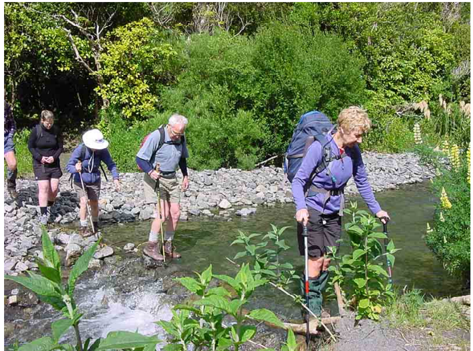
Above: Crossing the Tamiki Stream on the way to Stanfield Hut. (Stanfield Hut Trip | 13/11/2005 |).

The Wednesday Trampers Christmas Trip is being held at Castlepoint this year. We will be leaving at the earlier time of 7.30 a.m. for the 2.5 hr drive to our destination. If the weather is suitable we intend walking to the lighthouse and later, after a yummy Pot Luck lunch, we will take a stroll along the beach. This should be a fun day and we anticipate a good turnout for this annual event. We should be back in Palmy around 6 pm.