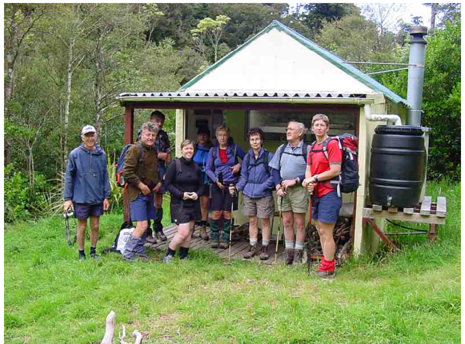
Above: Stanfield Hut. (Stanfield Hut Trip | 13/11/2005).