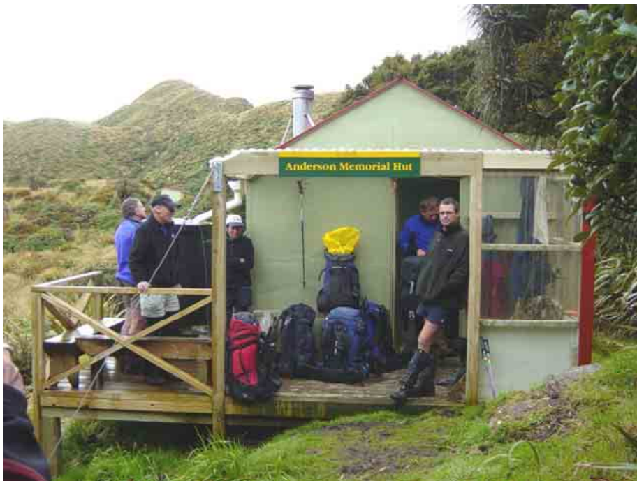
Above: Anderson Memorial Hut. (A wander in the Tararuas Trip | 21-24/10/2005).

safely and the people at the hut looked longingly across the river at us. We were carrying the dessert. So we headed up river to see what we could find and fortunately, just round the first bend were two large trees that had sacrificed themselves by falling across the river. So we crossed our handy bridge to finally reach the hut after a sometimes-traumatic 7.5 hr day.