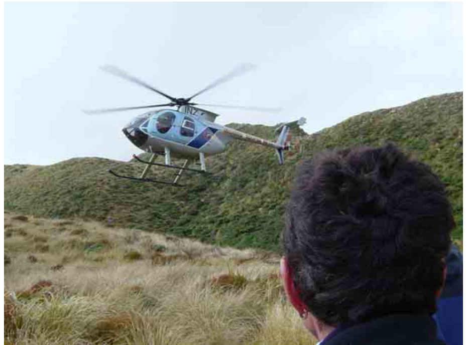
Above: Our ticket out of here! (A wander in the Tararuas Trip | 21-24/10/2005).