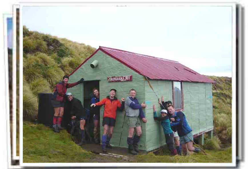
Above: The last hug of Maungahuka Hut before it was demolished. (A wander in the Tararuas Trip | 21-24/10/2005).