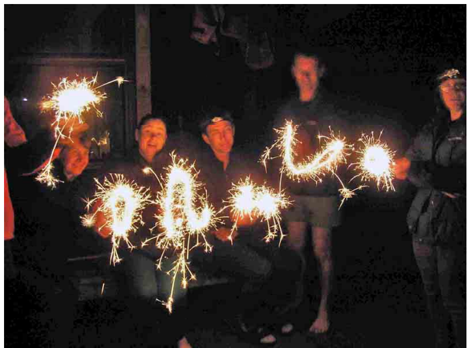
Above: Festivities in the hut, not quite sure what they are spelling 'dessert' perhaps? :) (Managahao Flats Work Party | 05/11/2005).

The hut came into view and the advance party quickly changed into dry clothes, lit the fire and settled down to some serious snacking while waiting for the others. The rear guard arrived and settled in and we were starting to make bets as to whether the adventure team would turn up or not when they suddenly appeared on the other side. Unfortunately the river had now risen to uncrossable proportions. The rain eased off so we headed down to the river flats while the adventurers started to head up river looking for somewhere to cross. Shortly thereafter they turned up having found a conveniently downed tree that bridged the river. We started on the vege clearance and were rather appalled to find a lovely beech tree had been roughly chopped down and just left where it fell. This along with a large fire ring built right in the middle of the helipad where most likely the work