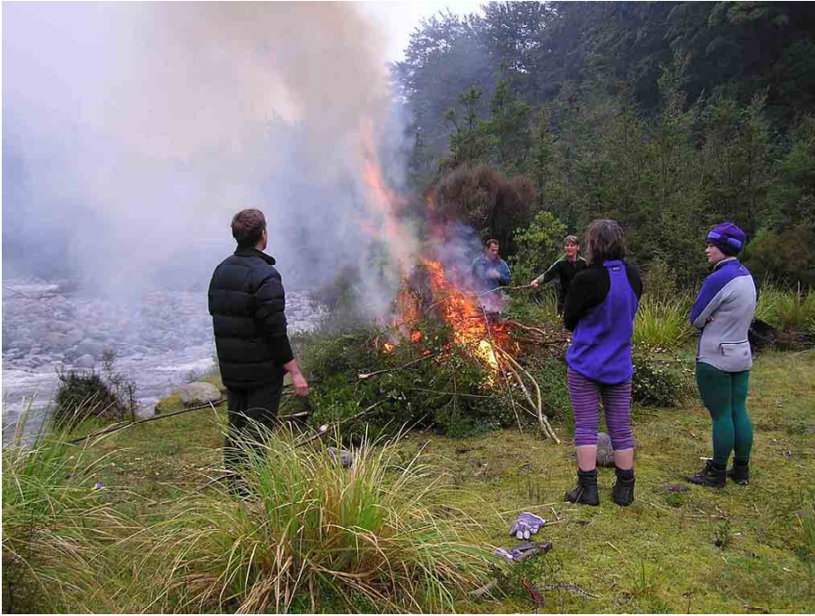
Above: The bonfire! They obviously couldn't wait till dark for their festivities! (Managahao Flats Work Party | 05/11/2005 |).