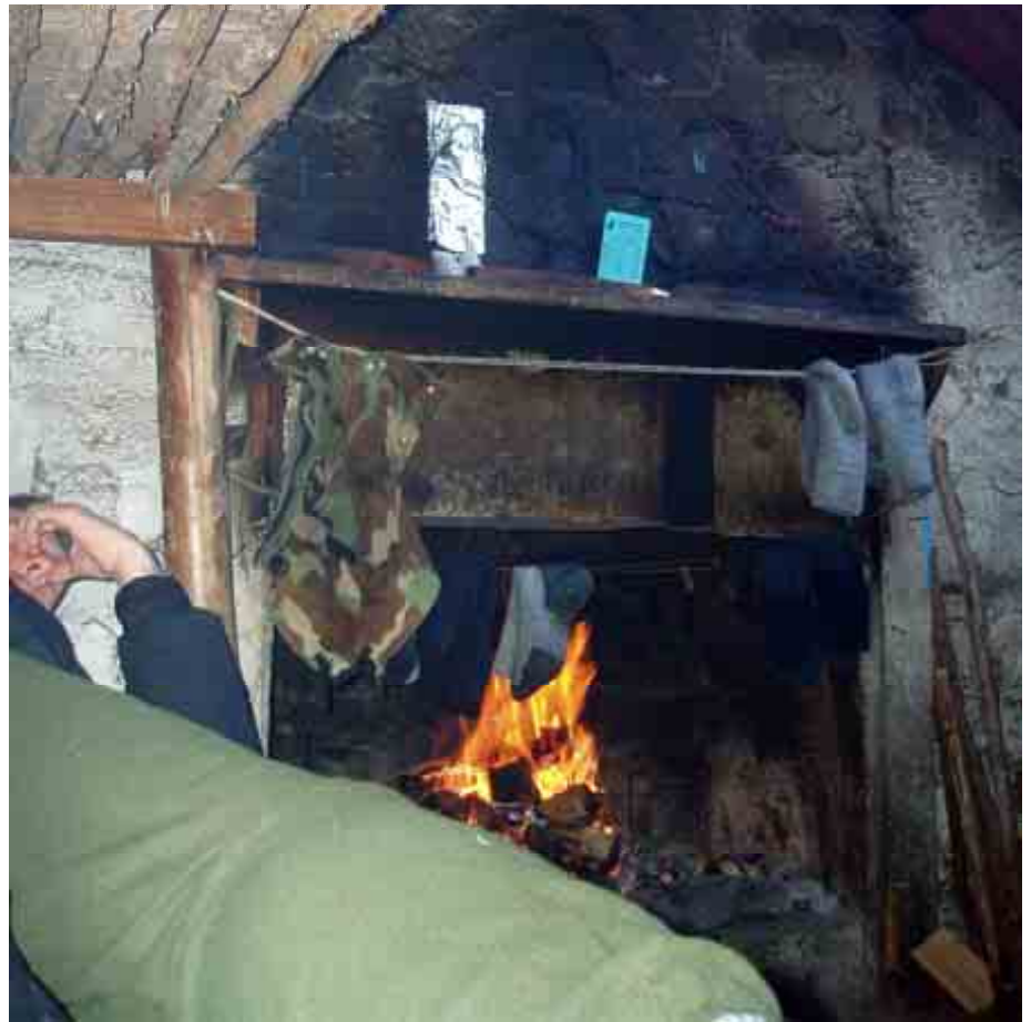
Above: Trying to keep warm inside Shutes Hut (Comet - Shutes Hut Trip | 17/09/2005 |).