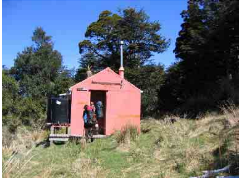
Above: Hinerua Hut for lunch. (McKinnon Hut Trip | 25/09/2005 |).