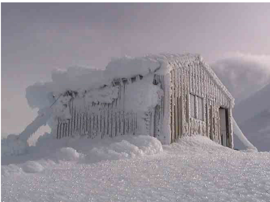
Above: Rimed Syme Hut. Winner of the topical section of the MTSC photo competition.