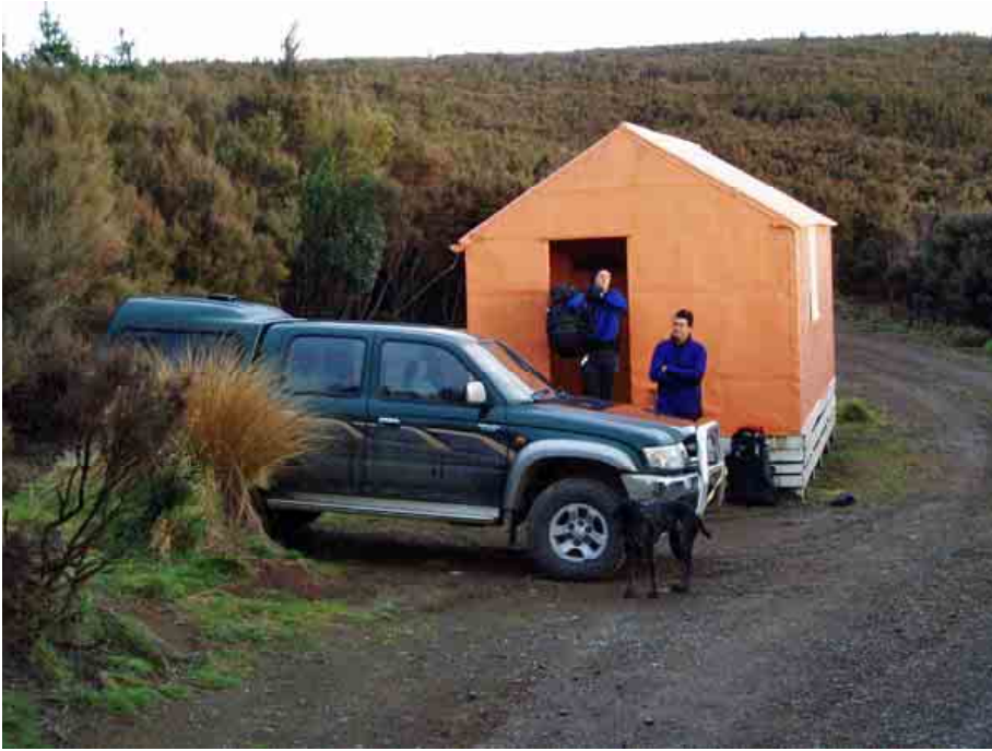
Above: Comet Hut. (Comet - Shutes Hut Trip | 17/09/2005 |).