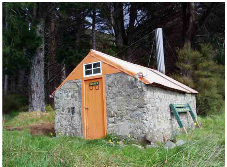
Above: Shutes Hut. (Comet - Shutes Hut Trip | 17/09/2005).

They picked me up early on Saturday morning and with a bit of discussion we made our way to the Mill Road end. It was a beautiful sunny day and it wasn't long before we were across the river and climbing up through the scrub on the farmland. I distinctly remember hearing mutterings about how hot it was, a reminder of how unpleasant summer tramping can be at times. At the bush line a nice big orange triangle showed us the way into the forest. Several cattle had also followed the path into the bush and we travelled a long way along the ridge before leaving the cattle sign behind. It was so lovely having a late lunch at Hinerua Hut that we were almost tempted to stay. But we carried on up onto Broken Ridge and along to Paemutu, where we dropped into Tussock Creek. Travel along the tops had been slow as the snow was quite deep in places, going down the Tussock Creek valley the snow was very deep in places and it was even hard work going down hill. Once we reached the Kawhatau River it was just a paddle