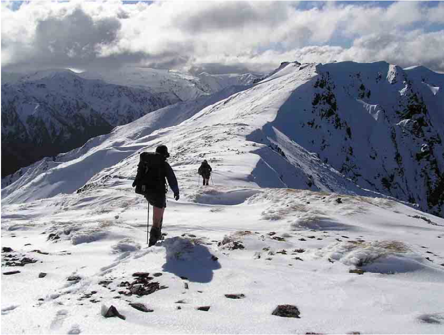
Above: Heading along Broken Ridge. (McKinnon Hut Trip | 24/09/2005).

and splash through what seemed surprisingly warm water, however the snow on the riverbanks indicated a somewhat different temperature. Waterfall Hut was reached before dark, it had been a long day but we were revived by a nice warm fire and dinner.