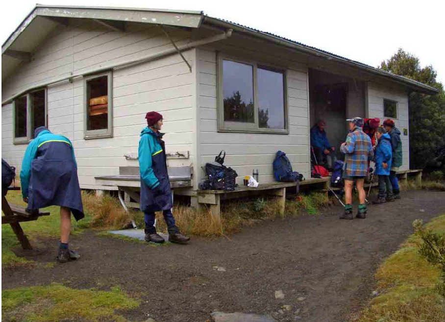
Above: The old and new Waihohunu Hut.