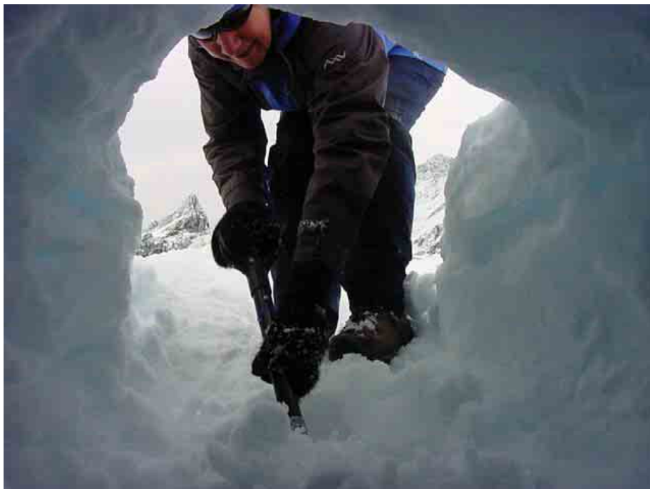
Above: Digging the snowcave (Photo: Tim Swale).

In the afternoon we headed off above the lift well away from the skiers to an area where we could practice making a snow cave. This was done by cutting into a snowdrift and then piling snow over our packs to make a large mound. Finally we tunneled in to find our packs, removed them one by one and wonder of wonders the roof actually stayed up without collapsing! A bit more gouging and smoothing and we had a shelter big enough for 8 people. It had taken us over an hour but with the wind increasing and the outside temperature dropping we could really see the benefits of our