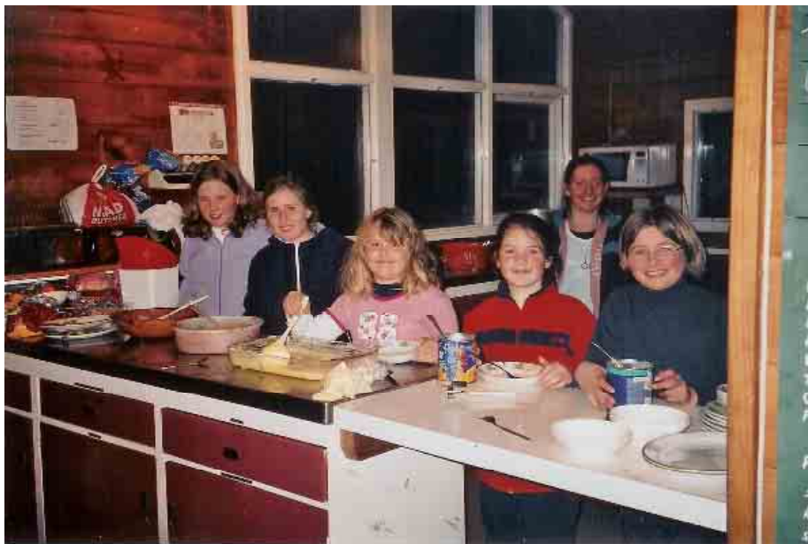
Above: Such lovely helpers, they made dessert for the lodge crowd last weekend, all 32 of us. (Beginners Snowcraft Trip;).