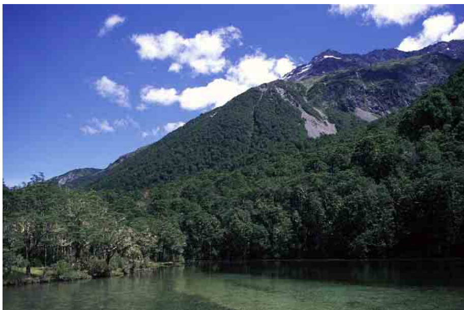
Above: Lake Paget and Faerie Queen part of the proposed St James/Spenser Mountains park in Canterbury. St James is New Zealand's largest pastoral lease.