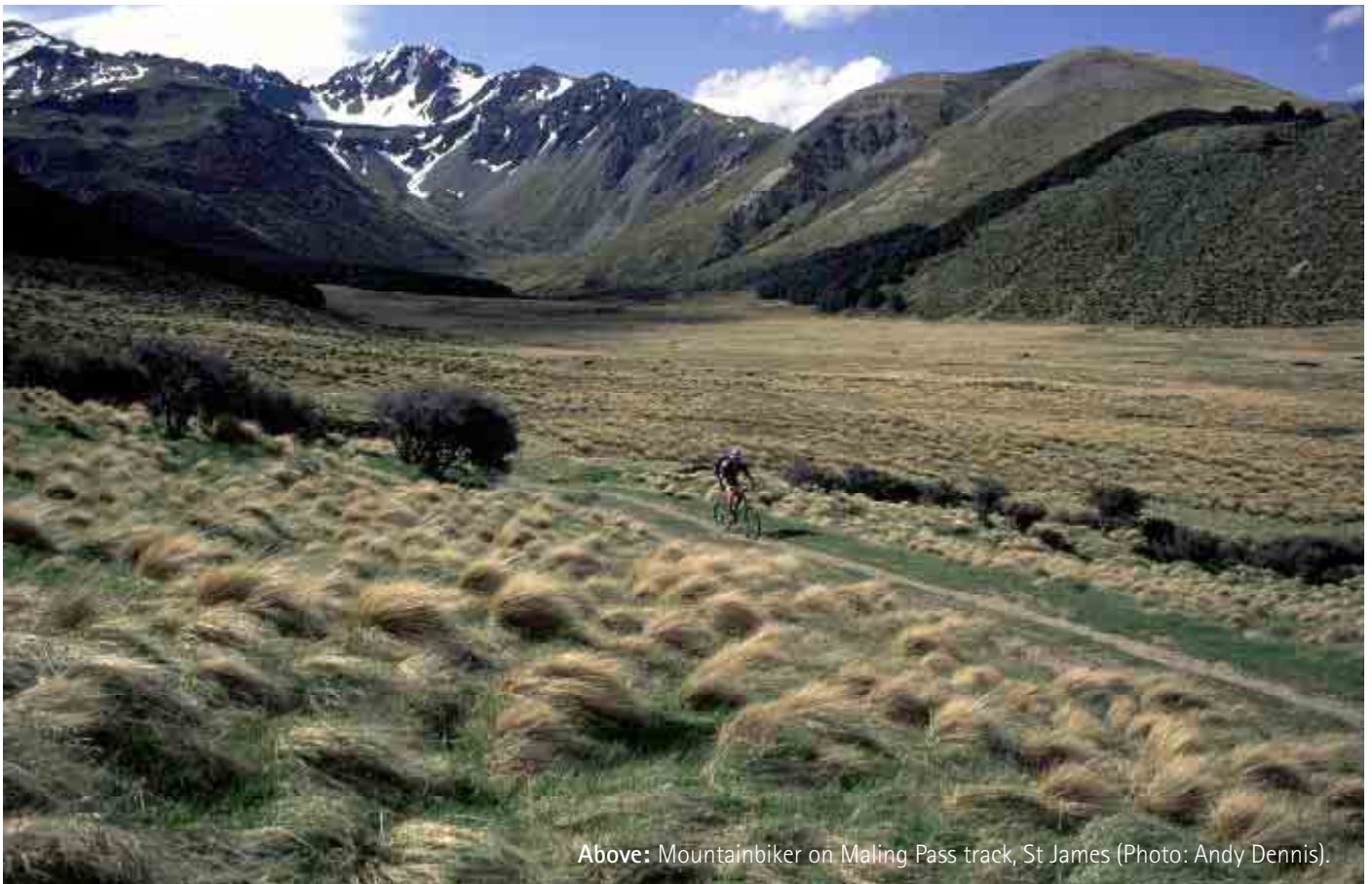
Above: Mountainbiker on Maling Pass track, St James.

Cone Hut is a two hour easy tramp in from Wall's Whare in the south-eastern Tararuas. We head west between Carterton and greytown finishing up at the end of the Waiohine Gorge Road (Wall's Whare site). The track starts with the wire bridge crossing of the Waiohine River then ascends reasonably fast for 30 min before a more gentle