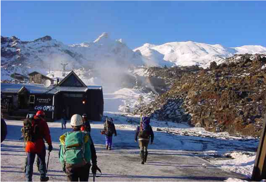
Above: Heading off to dabble in some snowcraft.

unlocked gate. Beyond there the road is a bit steep for a standard vehicle. We trudged along Takapari Road through the mist for 90 min before reaching the DoC sign at the top of the spur that heads down to Makawakawa Stream. It was cold up there, but the food gathering antics of Dave's dog Fred distracted us while we had our morning tea.