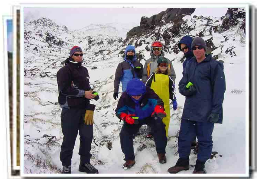
Above: Everyone stopping to pose for a photo on the recent basic snowcraft course.