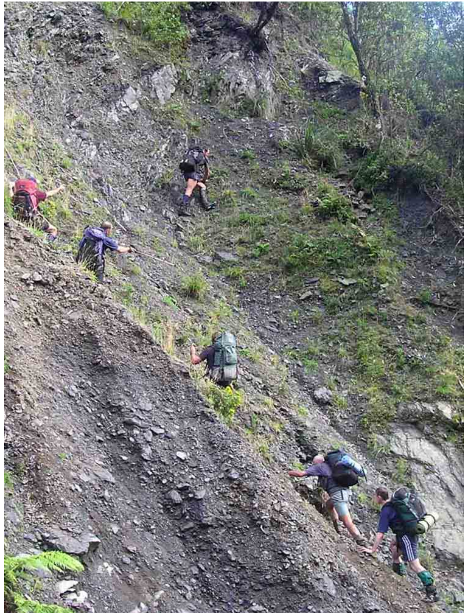
Above: One of the slips to negotiate on the Penn Creek Trip.

Finally, we reached the last slip. Another horror. It was 2-3 times wider than when trip leader last crossed it and commensurately more difficult. We all managed to cross the first section to a small grassy island. The braver party members then started across the second half of the slip while the rest of us looked on in consternation. These people were climbers, and they were gingerly