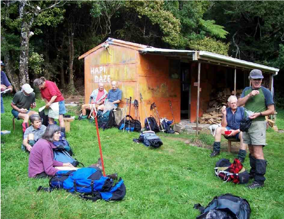
Left: Some of the weekday trampers having a good time outside Hapi Daze Hut.

Sea Scouts who told us that Burn hut was closed for painting, but luckily they had 'been prepared' and had brought tents. The weather was warm as we walked along the tops and although it was a cloudy day we had good views. The painters had gone by the time we reached the hut (though not the paint smell) so we sat in the bright white interior for lunch. As we dropped down into the Mangahao I was expecting the slimy step down into the first side stream with its number 8 wire handrail when, what should we find but a bridge. Not a little bridge but a big wooden humpbacked monster. The area is getting far too civilised. After following the increasingly renovated track to the number 2 dam we waited patiently while Dave and Alan retrieved the other car from the top dam. All-in-all a pleasant trip; varied terrain but not too demanding.