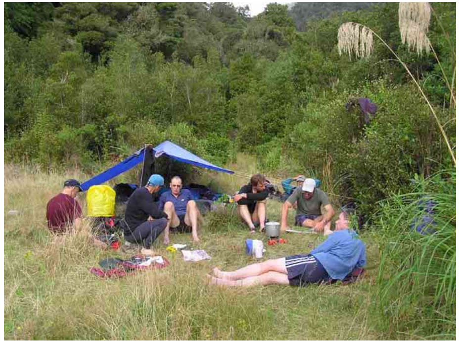
Above: Outdoor camp at Penn Creek Hut.