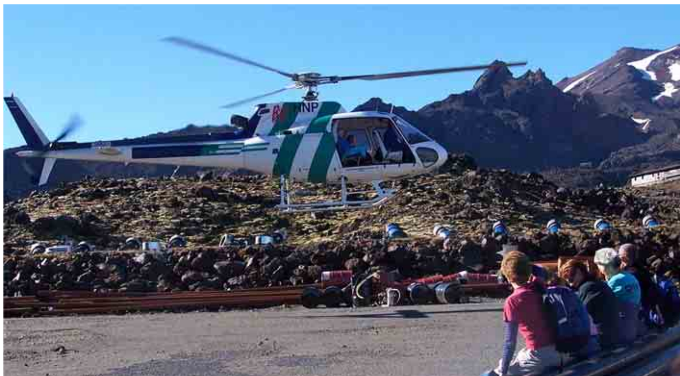
Above: Rubbish away! Helicopter clean up on the mountain.