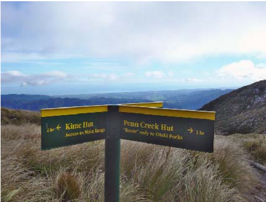
Above: The sign on Table Top.

interested parties being unavailable, however, by Friday night a keen team of 4 were ready to make the assault up Rae Ridge and down to Penn Creek.