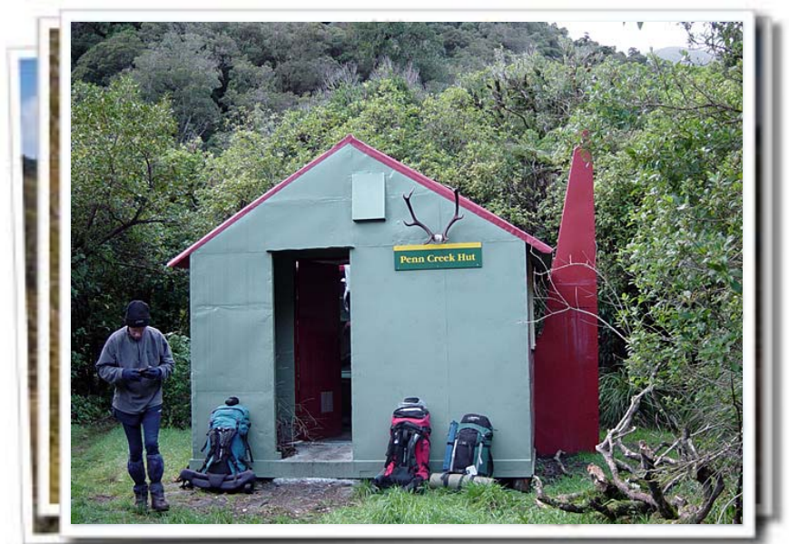
Above: A line up of packs outside Penn Creek Hut. See page 6 for the trip report.