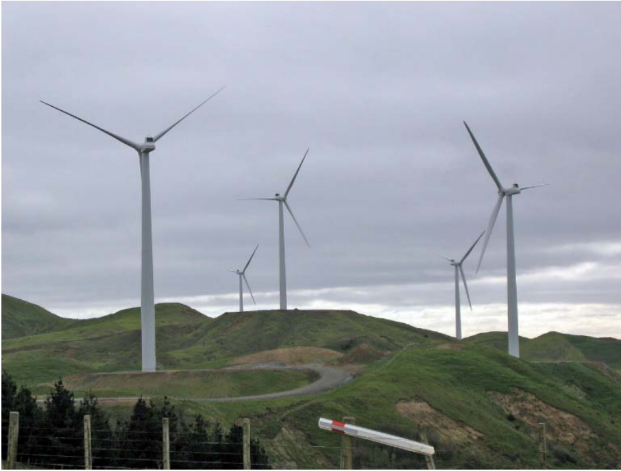
Above: New Meridian wind mills on the Ruahine Ranges.